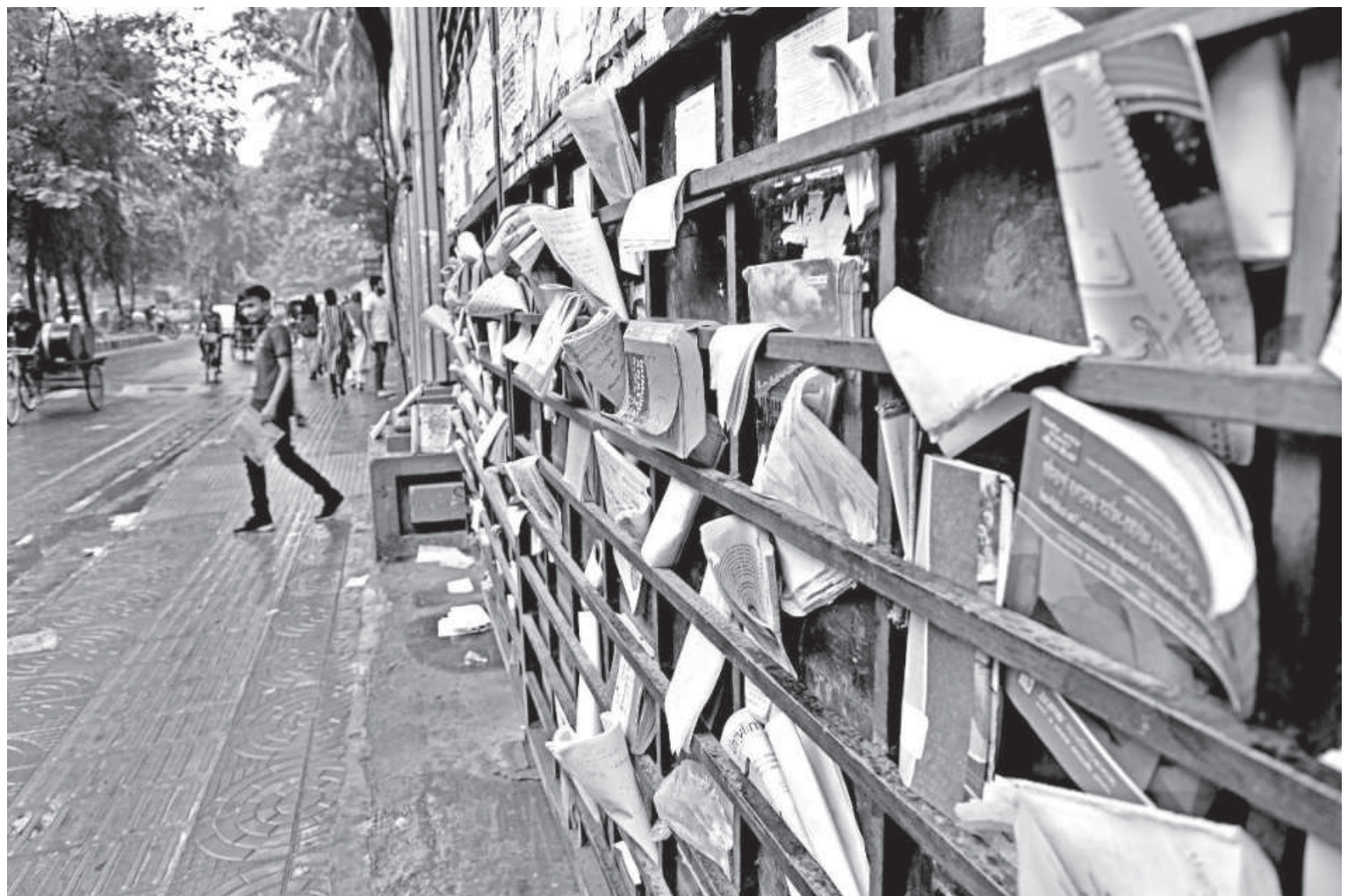
The last minutes before an exam are always for revision. Before entering the exam halls, many students, who are sitting for their honours exams at Eden College, keep their study materials tucked at the gate of the college. This photo was taken recently.