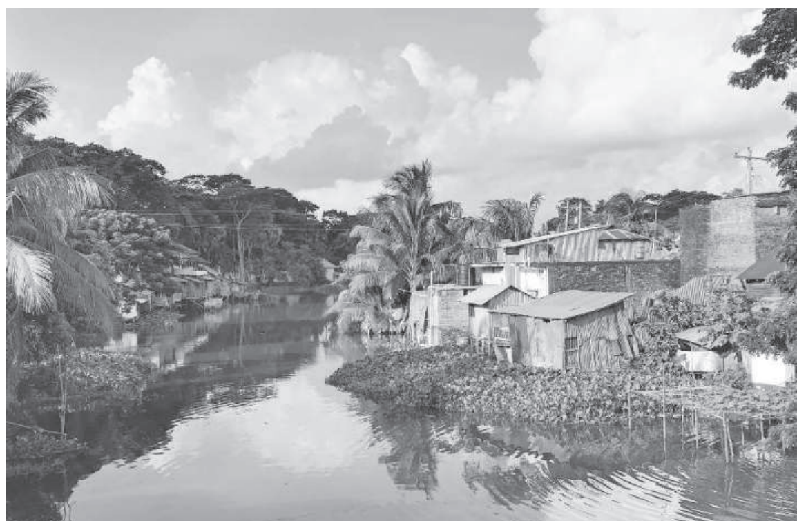
As days go by, Barguna's Chawra canal turns even narrower, inching towards extinction. Encroachers have built at least 200 structures on both sides of the waterbody. On top of that, the water is being polluted due to dumping of waste from buildings and nearby shops.