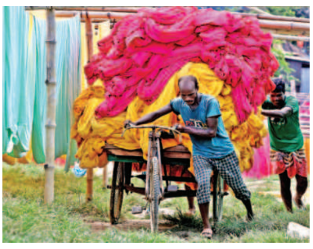
Yellow, green, pink, red, blue -- the mesmerising rows of freshly coloured fabric are hung to dry in an open space beside a textile mill in Narayanganj Sadar upazila. Due to the pandemic, many of these mills were on the verge of closure. Now that things have returned to normal, business is running quite colourful. This photo was taken recently.