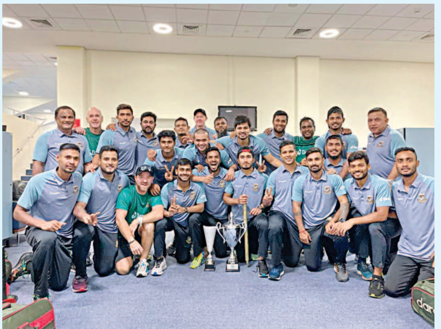
This is a representational image of a team celebrating after winning a series against lower-ranked opposition. Other than that, it has nothing to do with the story.