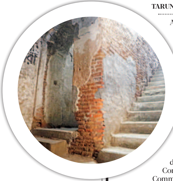
▲ A staircase in the northern wing of Bara Katra.