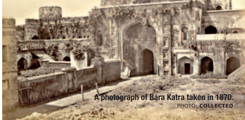
A photograph of Bara Katra taken in 1870.

Bara Katra is an ideal depiction of the Mughal architectural style. The two-stoey building was erected around an open rectangular courtyard. The palace overlooks the Buriganga River. There were two gates on the southern and northern corners of the palace and two small gateways on the western and eastern sides.