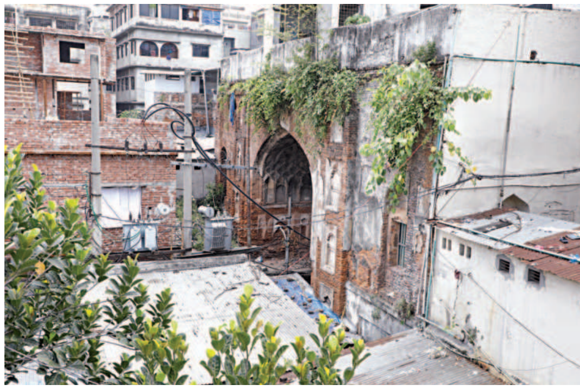
The north gate of Bara Katra.