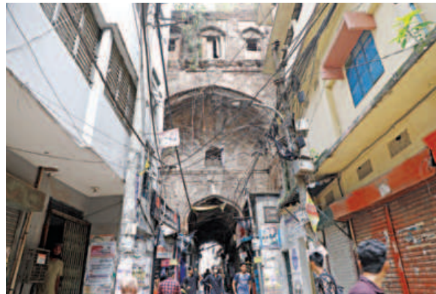
(From left) The south gate of Bara Katra; a part of the historical site which is now being used as a madrasa.