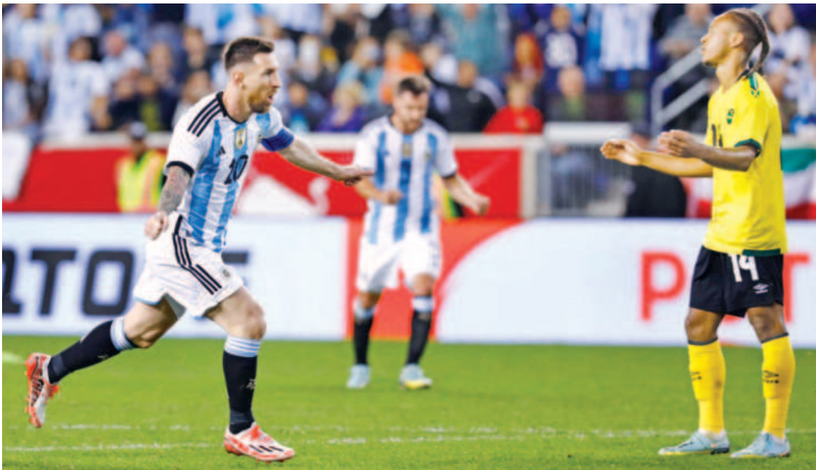
Argentina superstar Lionel Messi celebrates one of his two goals during his side's 3-0 victory over Jamaica in a World Cup warm-up friendly in New Jersey on Tuesday.