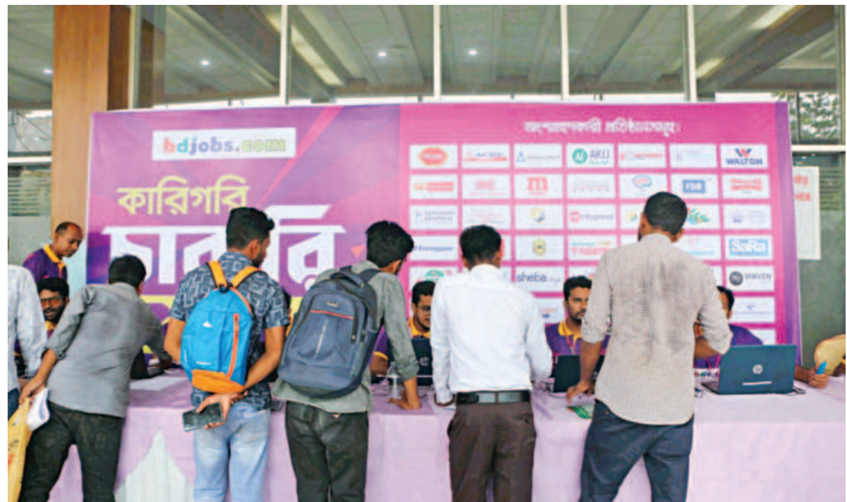
Jobseekers are seen speaking to information desk attendants at a job fair for technical positions in various companies at the PSC Convention Hall in Dhaka's Mirpur yesterday.