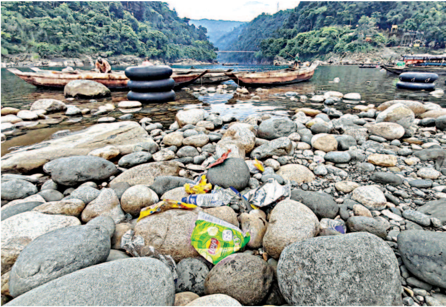
Packets of chips, empty water bottles and other garbage strewn across Jaflong's Zero Point, a popular tourist destination. Such littering by callous tourists spoils the beauty of this otherwise pristine place. The photo was taken yesterday.