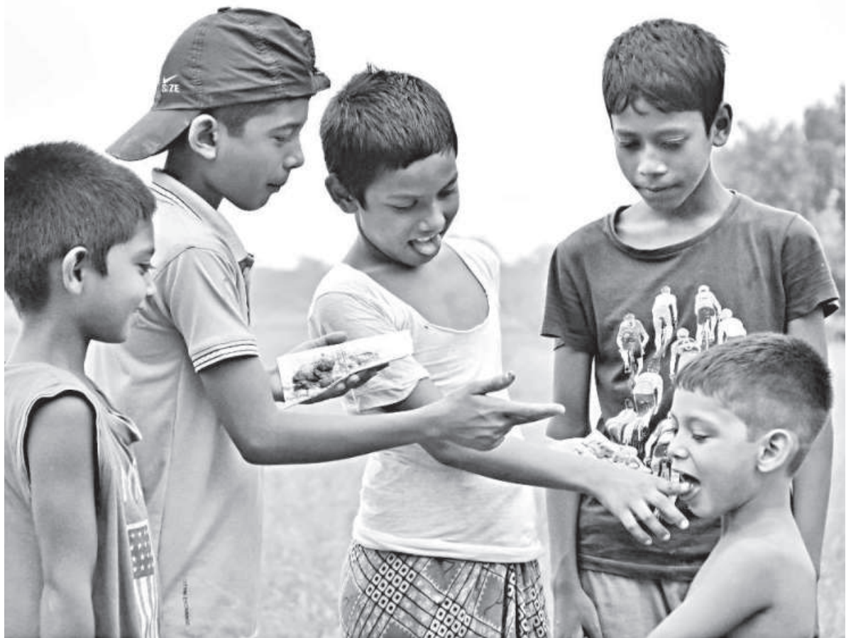
What's more enjoyable than sharing tamarind chutney among friends? This photo was taken in Barishal Sadar recently.