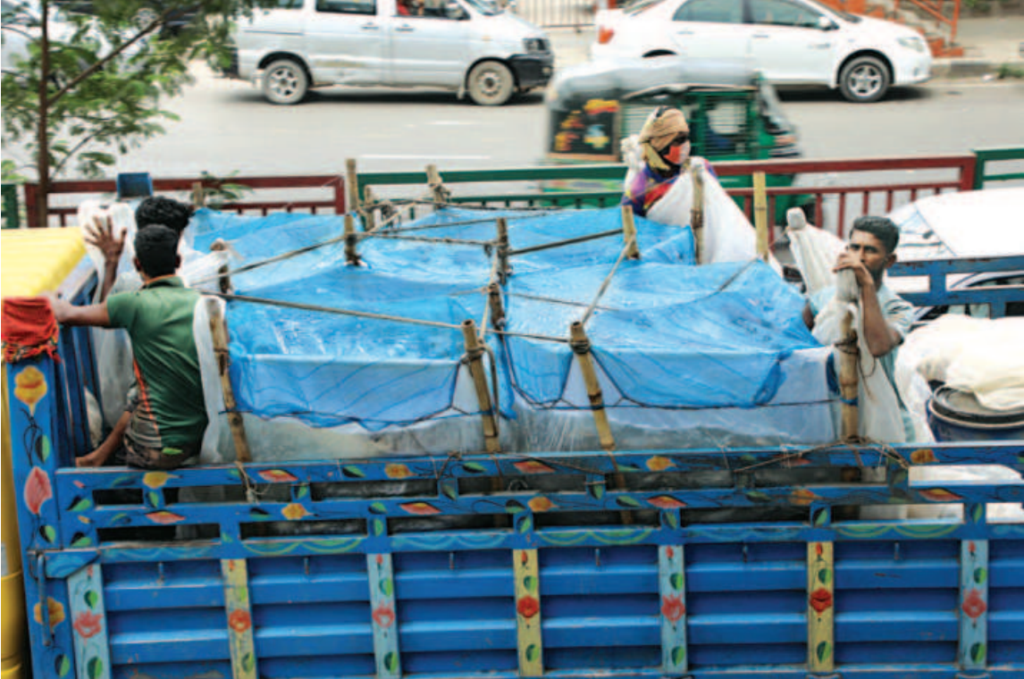
In a pickup truck loaded with portable containers made out of polythene, fishers are transporting rui and katla fry from Mymensingh to Cumilla, to release them in a waterbody for farming. This photo was taken from Tejgaon Industrial Area recently.