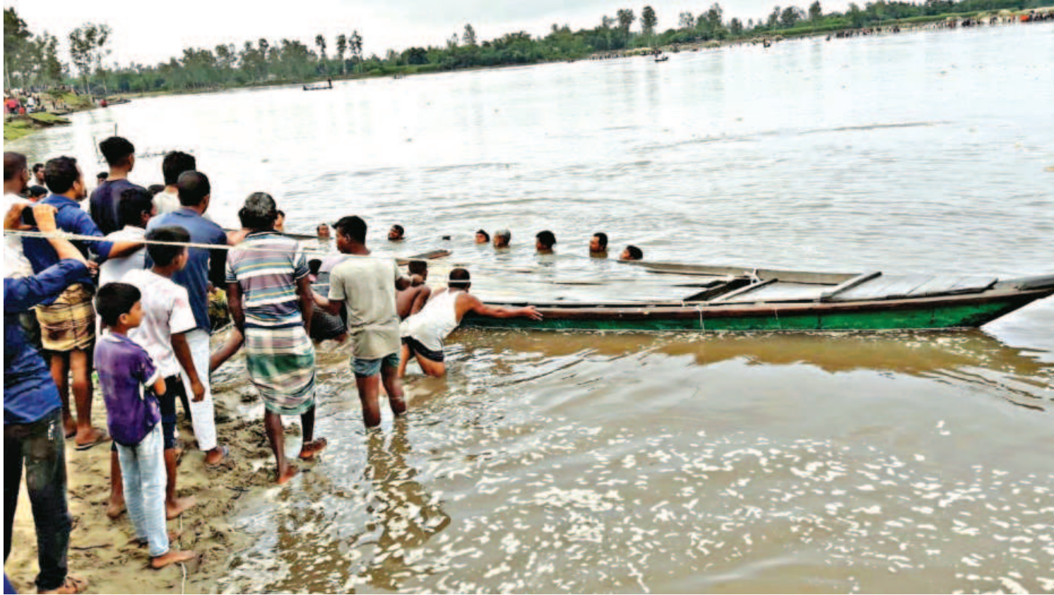
The boat that capsized in the Karatoa was brought to the bank of the river in Awalia ghat area in Panchagarh's Boda upazila. At least 24 people, most of them Hindu pilgrims going to celebrate the Mahalaya festival, died in the accident.

The death toll is likely to rise further as at least 65 passengers were reported missing.