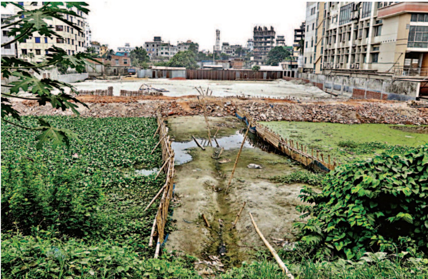
An earthen path through the DND canal in Dhaka's Demra blocking whatever water flow there was. This is one of the many such encroachments on the canal that could have played a major role in reducing waterlogging in vast areas of Narayanganj and Dhaka. But now it's a swollen drain full of smelly garbage. The photo was taken recently.