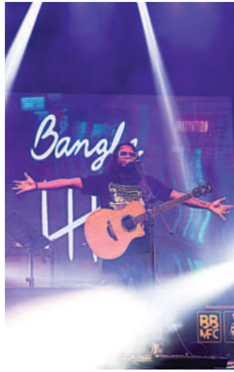
Bangla Five at their best.