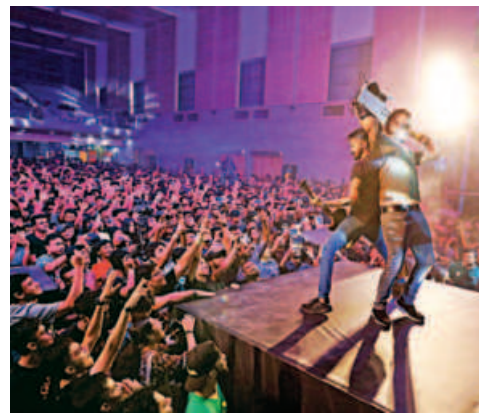
Arbovirus in action.