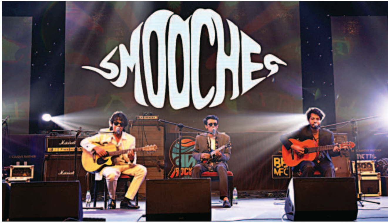
Rising band Smooches during their set.