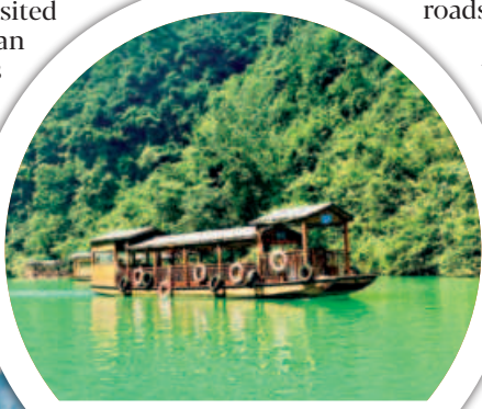
Boat trip at Beofeng lake.