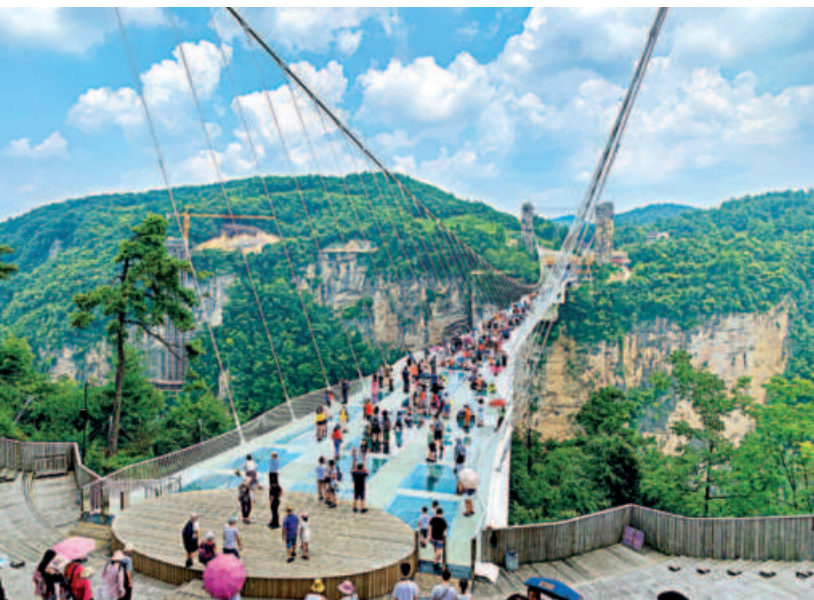
World's longest glass bridge.