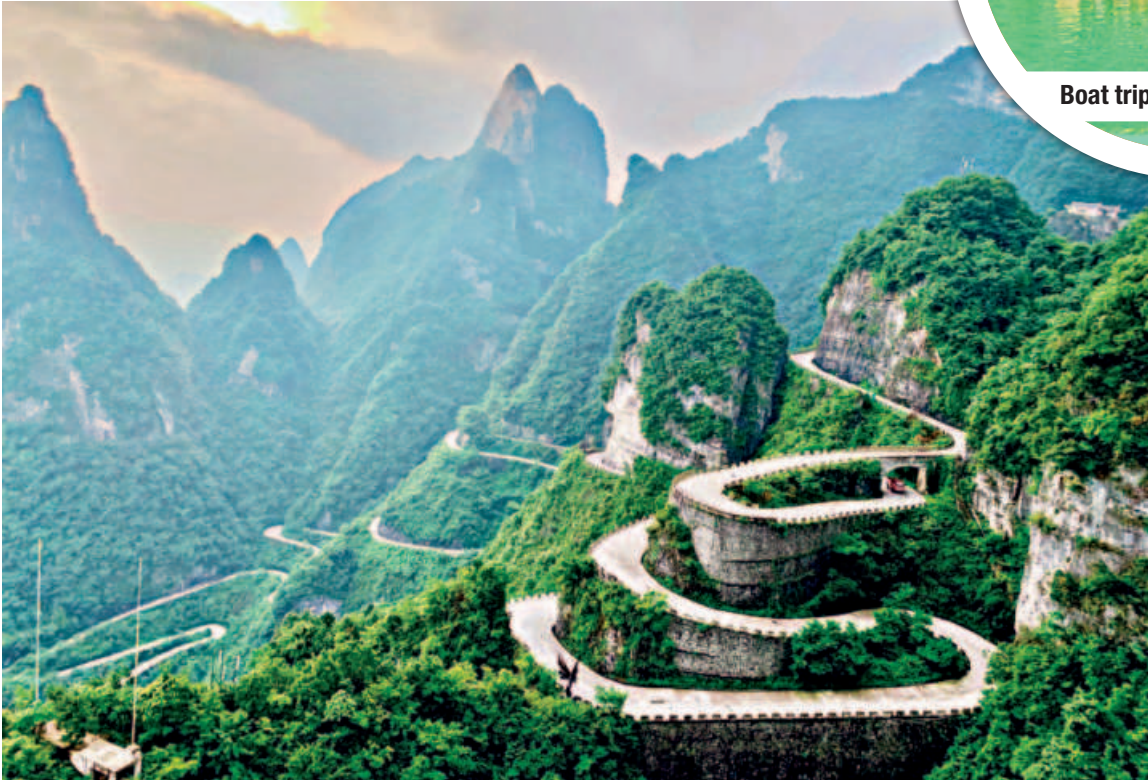
Heaven Linking Avenue with 99 curves.

Going in a group saves money. The 3-day trip, inclusive of all costs, may cost you around 70,000 BDT each person.