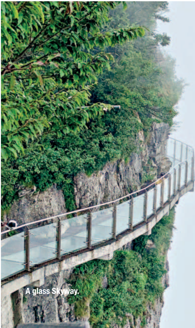
A glass Skyway.