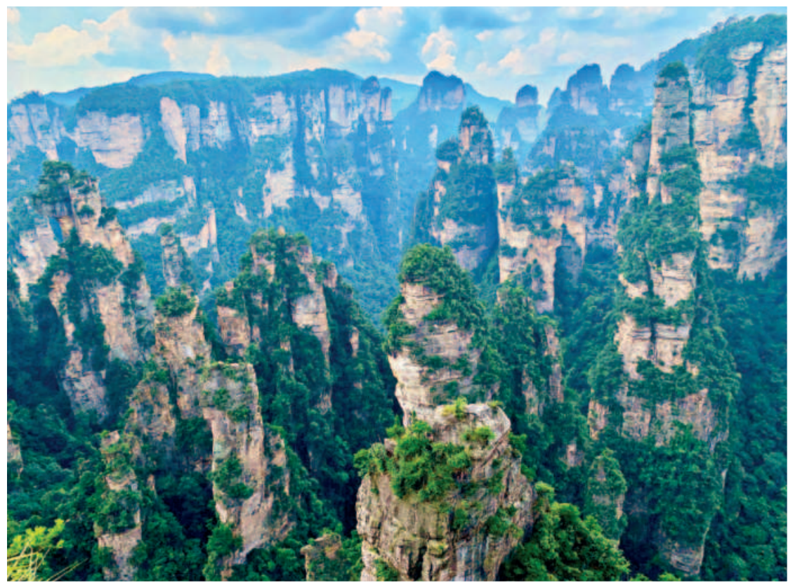
Yuanjiajie Scenic Area.