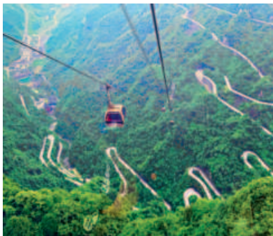
Cableway over the Heaven Linking Avenue.

It doesn't matter how many times you have seen pictures of this place. Once you visit the area, you will be amazed, guaranteed.