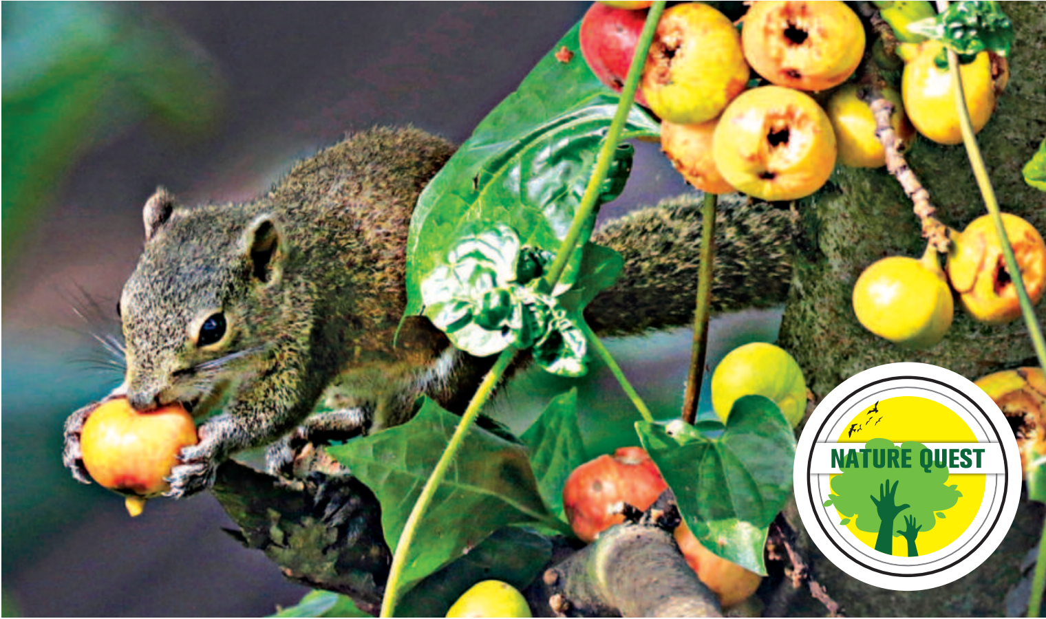
FIGGIN' AROUND ... An Irawaddy squirrel spotted munching on a small-leaved fig in Sylhet city's Munshipara area. The little rodent is native to Bangladesh, China, India, Myanmar and Nepal and gets its name as those in Myanmar can mostly be found living in forested areas west of the Irawaddy river. A species of tree squirrels, it prefers living in a number of types of forests. However, like most arboreal animals, the Irawaddy squirrel is threatened by habitat loss as mindless felling of trees and deforestation is an ongoing issue. Once a common sight, squirrel numbers have been falling drastically and you now have to be lucky to spot one!