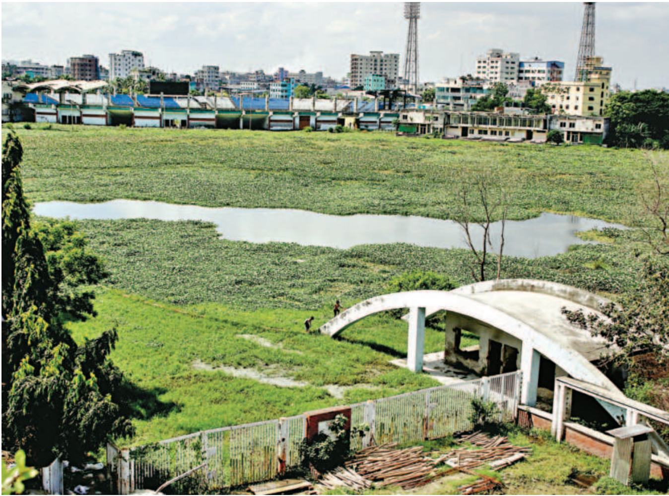
It's not a wetland; it is actually the practice facility of the Fatullah Cricket Stadium in Narayanganj. The inside of the stadium is also in a sorry state due to a lack of maintenance. No matches have been held here in around two years. The photo was taken yesterday.