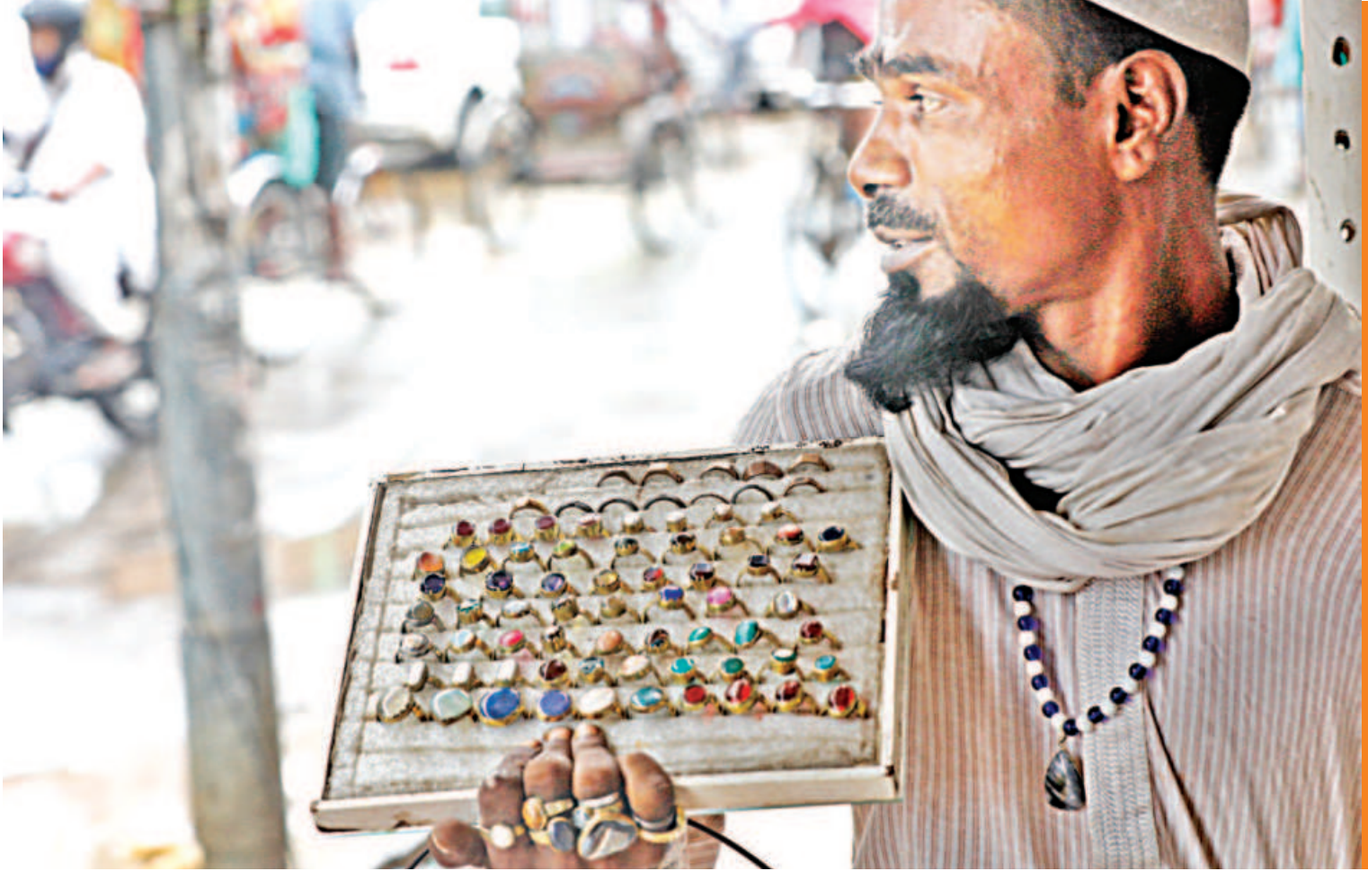
These colourful rings come with different connotations for different people. While some like them only as accessories, others believe they can bring good fortune and end the perils of their lives. This ring-seller uses this to his advantage and sells the same rings at various rates to people, depending on their purposes. The photo was taken in Tejgaon area recently.

Every party, including Awami League and BNP, has such provisions in their party’s charter. This provision has been in our party’s charter since its formation and was also approved in the party’s ninth council.