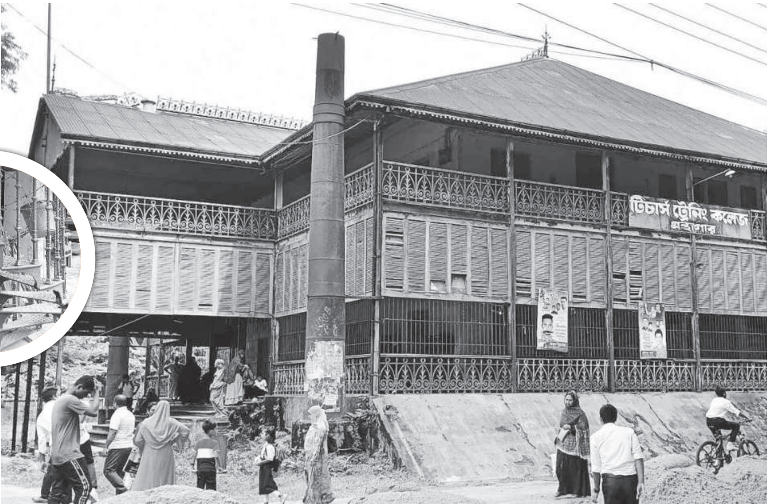
The legend of this 143-year old two-storied building, formerly known as Alexander Castle, and now Rabindra Botomol, is unknown to the youths. The “castle” is now in dilapidated condition, thanks to negligence of the authorities concerned.