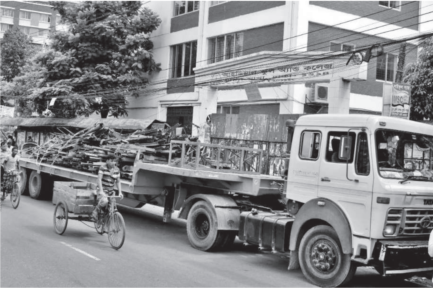
A truck, loaded with rusty iron bars, is kept parked right in front of a school in the capital's Mugda area. Despite there being a designated spot for parking such heavy vehicles in the area, the truck has been kept there, creating inconvenience for students and teachers alike. This photo was taken yesterday morning.

The lawyer told The Daily Star that hearing of the petition may be held any day next week.