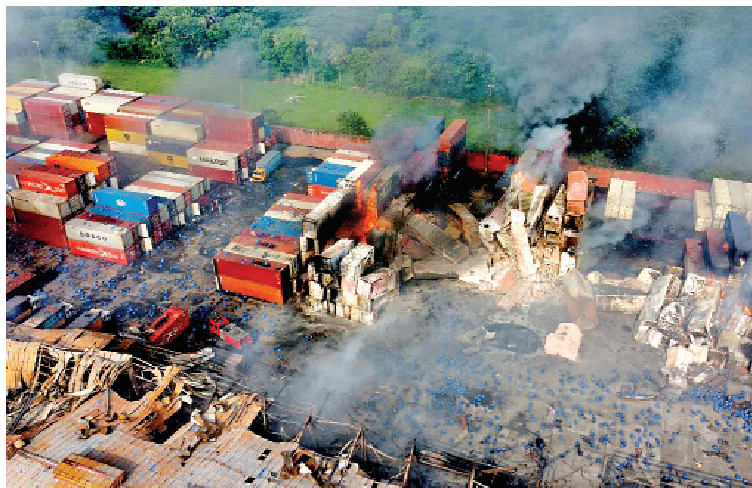
The deadly explosions and fire inside BM Container Depot in Sitakunda, Chattogram on the night of June 4 left at least 51 people dead and 250 others injured.