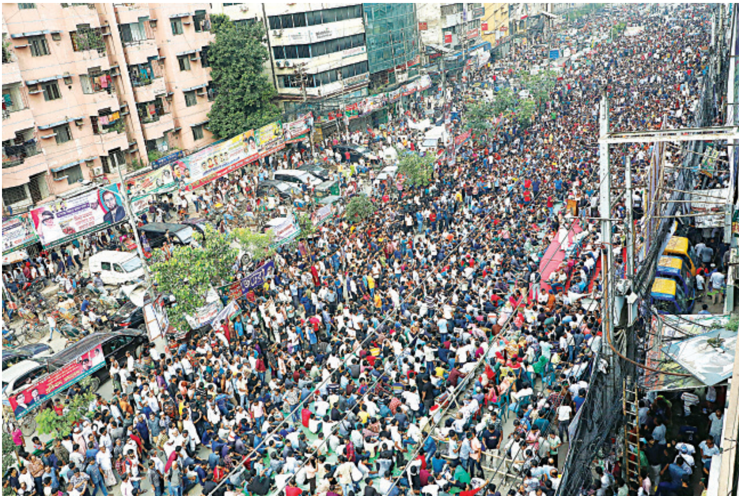
Thousands of BNP leaders and activists at a rally in front of the party's office in the capital's Nayapaltan yesterday. BNP's Dhaka city units organised the rally in protest of the recent attacks on demonstrators in different districts.