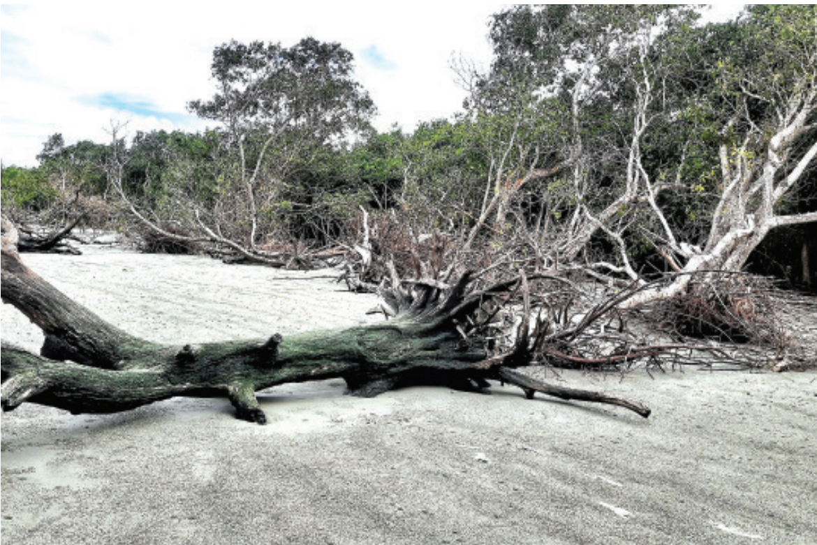
There are thousands of dead mangrove trees on Kotka beach of the Sundarbans in Bagerhat. Forest department officials say sand brought inlands during cyclones in recent years formed a very thick layer on the ground, causing the trees to die.