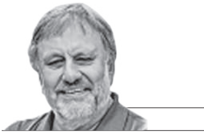
Dr Slavoj Žižek, professor of philosophy at the European Graduate School, is international director of the Birkbeck Institute for the Humanities at the University of London and the author of Heaven in Disorder .

Copyright: Project Syndicate, 2022 www.project-syndicate.org (Exclusive to The Daily Star)