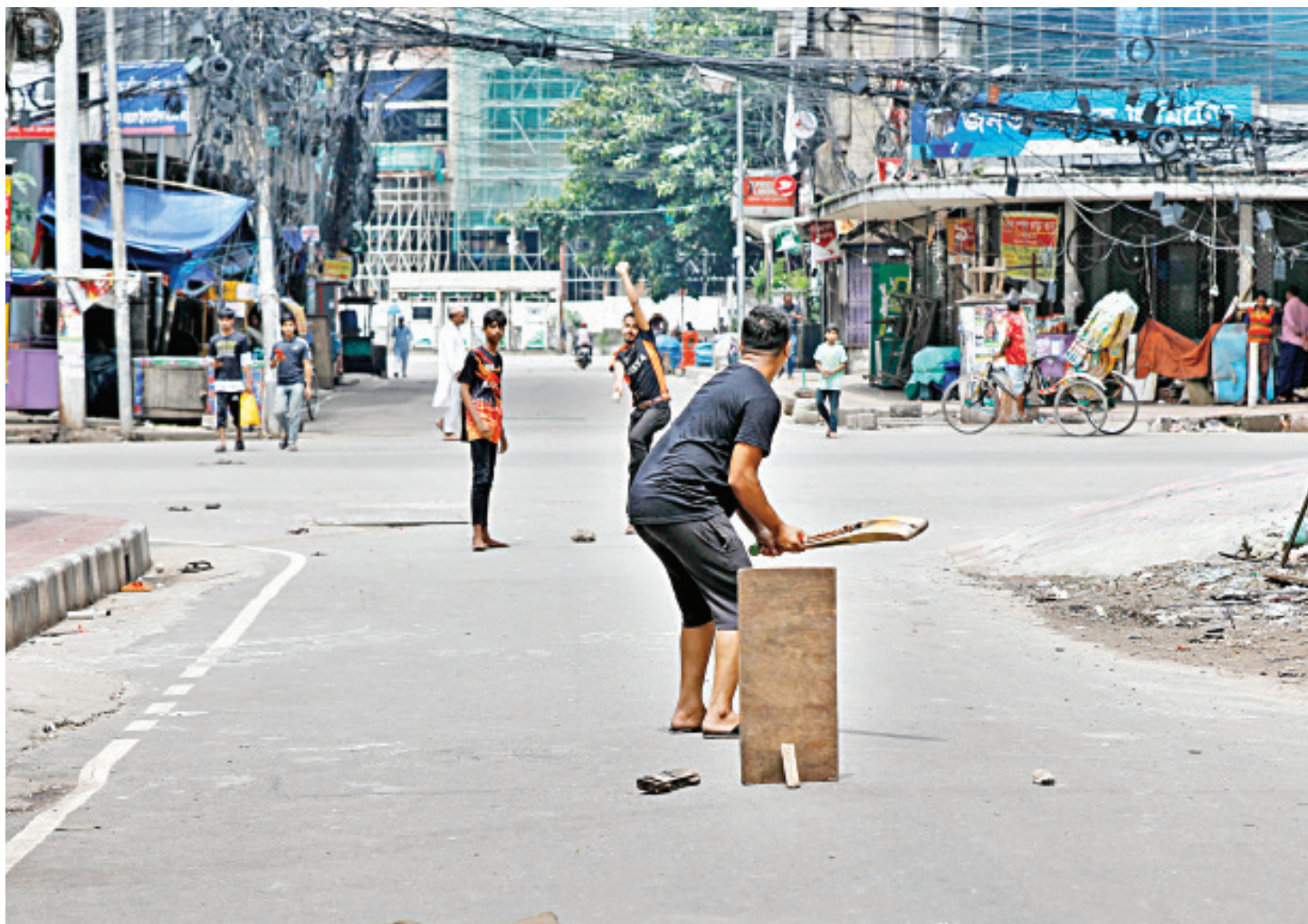
Taking the opportunity of almost vacant streets on Fridays, youths engage in a spirited game of cricket in the capital's Dilkusha area yesterday.