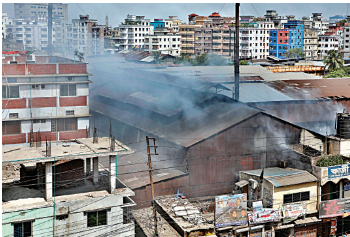
Smoke rises from a steel factory in the capital's Shyampur. Operation of smoke-emitting factories in the city goes on unabated, exposing the residents to health hazards. The photo was taken recently.