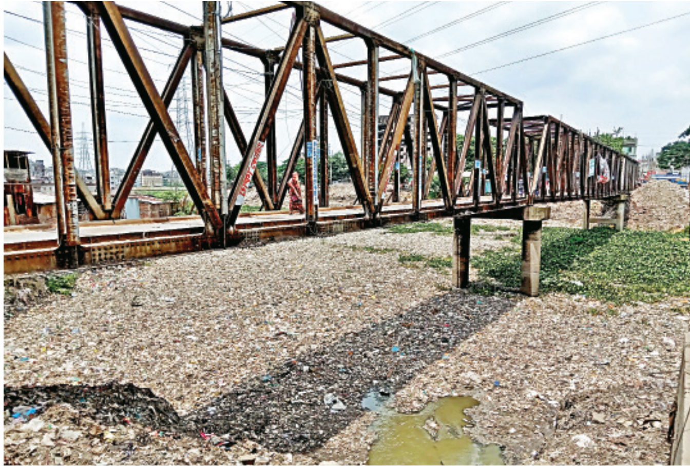
This channel of the Buriganga under Kamrangirchar bridge in the capital's Lalbagh is absolutely clogged by discarded plastic bottles and bags, used in factories and households. The Dhaka South City Corporation has recently taken an initiative to clear the channel so water can flow through. The photo was taken yesterday.

Since October 2008, the BTCL has been skipping its payments to