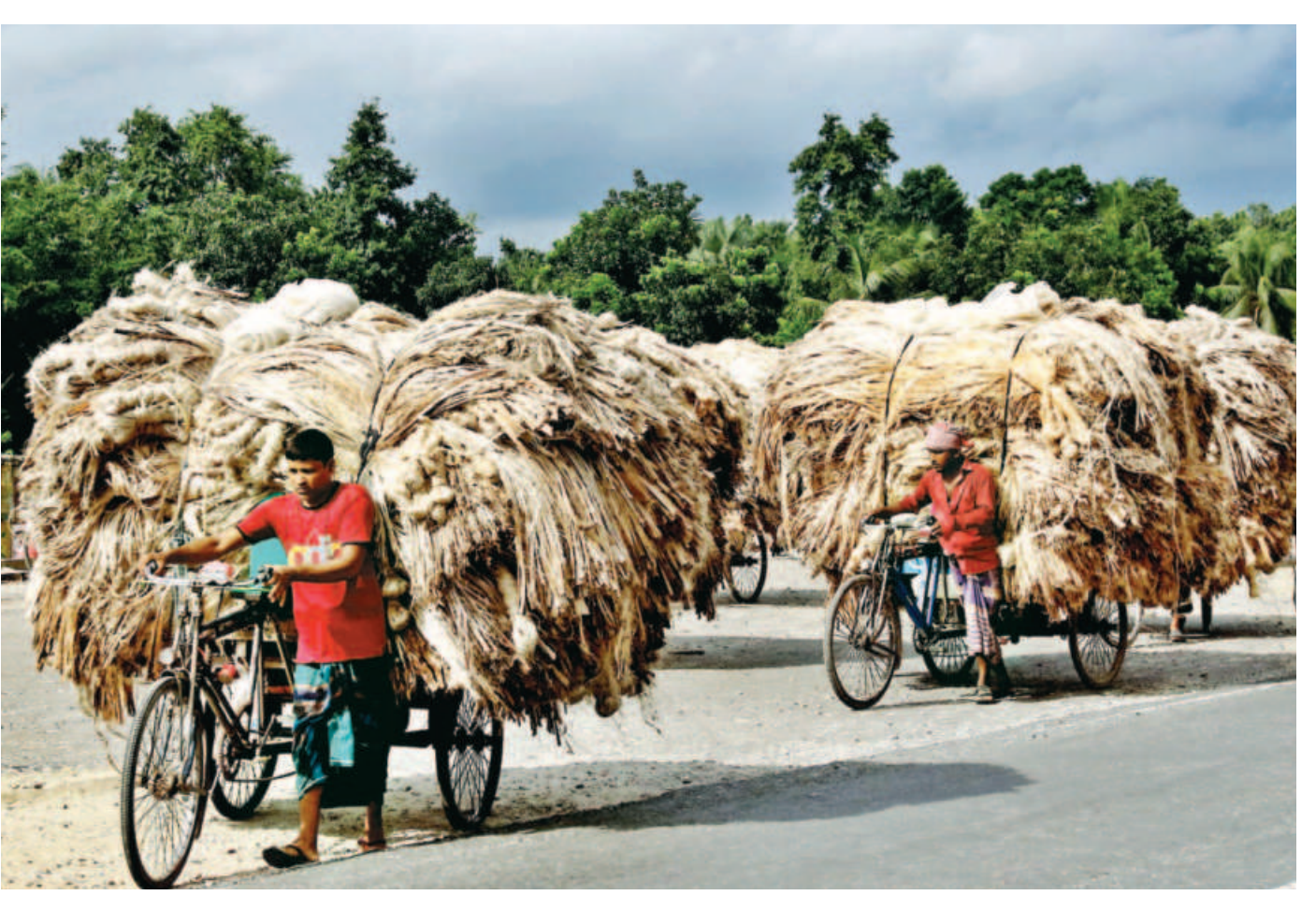
Piles of jute being carried on rickshaw vans to the wholesale market in Shibaloy upazila of Manikganj. This century-old market bustles with growers from around the district bringing their golden fibre for sale during the peak season. Jute mills from near and far usually collect their raw material from here.