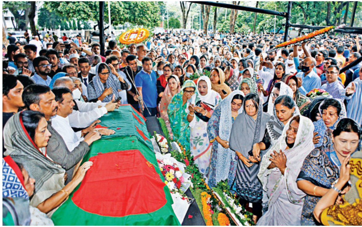
People from all walks of life pay homage to Sajeda Chowdhury at the capital's Central Shaheed Minar yesterday afternoon. Later, she was buried at Banani graveyard with state honour after Asr prayers. The veteran leader passed away at Dhaka Combined Military Hospital on Sunday night.