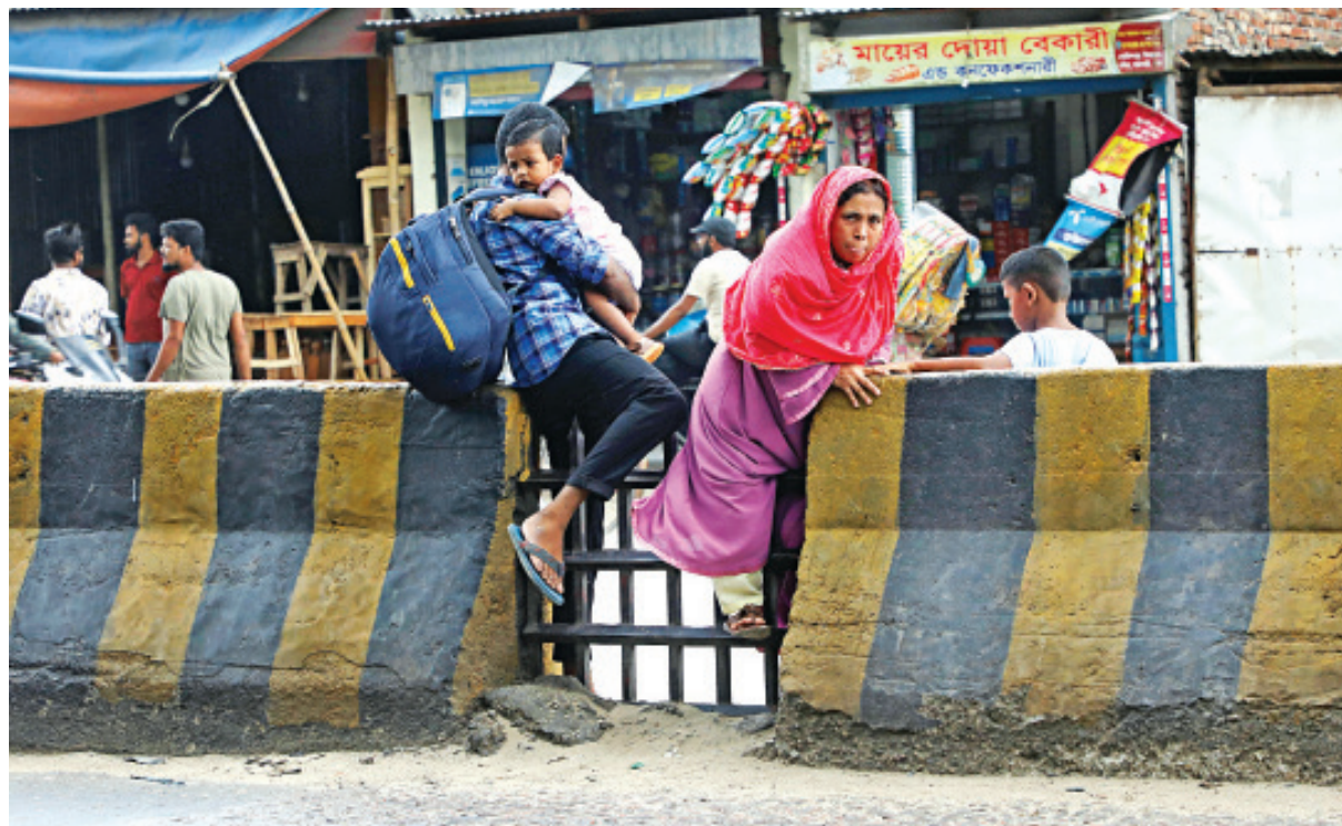
Carrying a child, a man crosses a divider on Dhaka-Chattogram highway that was installed there for the sole purpose of preventing them from taking up this risk in the first place. A woman too was seen doing the same. Risking lives, many choose to cross the highway in this manner just to save some time. This photo was taken in Jatrabari's Donia area.