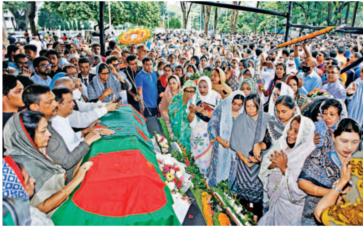
People from all walks of life pay homage to Sajeda Chowdhury at the capital's Central Shaheed Minar yesterday afternoon. Later, she was buried at Banani graveyard with state honour after Asr prayers. The veteran leader passed away at Dhaka Combined Military Hospital on Sunday night.