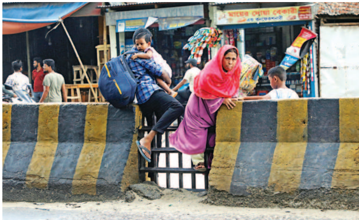
Carrying a child, a man crosses a divider on Dhaka-Chattogram highway that was installed there for the sole purpose of preventing them from taking up this risk in the first place. A woman too was seen doing the same. Risking lives, many choose to cross the highway in this manner just to save some time. This photo was taken in Jatrabari's Donia area.