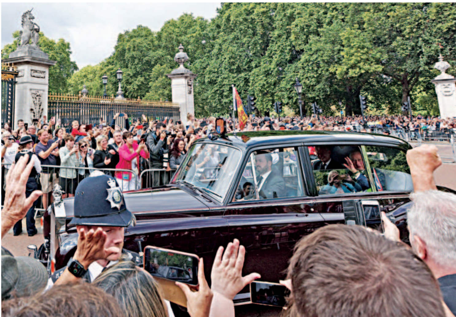
People gather as Britain's King Charles III is driven back to Buckingham Palace in London yesterday, after being proclaimed as the new King. The proclamation comes a day after he vowed in his first speech to mourning subjects that he would emulate his "darling mama", Queen Elizabeth II who died on September 8.

As supreme governor of the Church of England, Britain's monarch has the power to appoint bishops and archbishops, but again this is exercised only on the advice of a Church Commission.