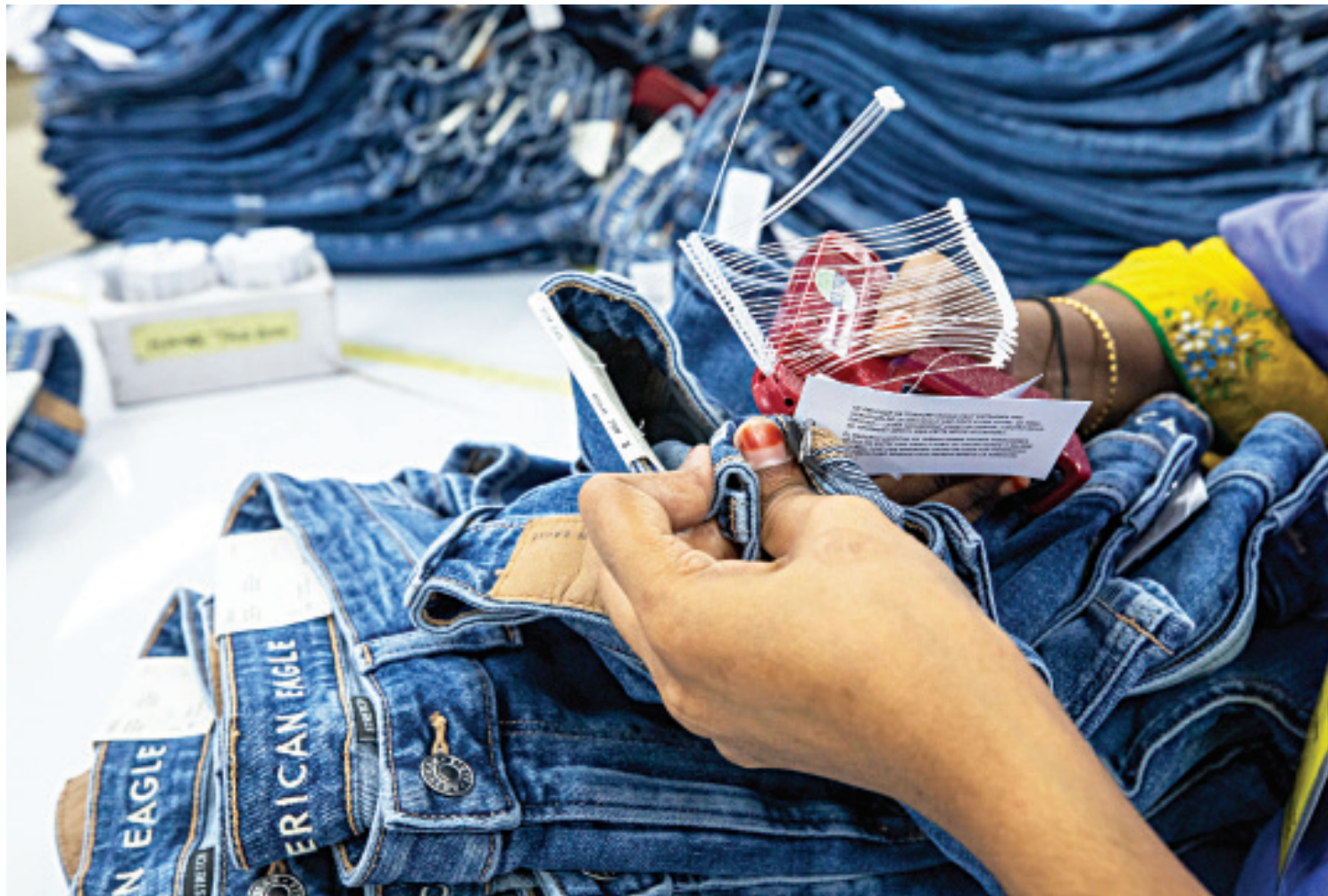
With plans to raise its share in global apparel market to 10 per cent by 2025, Bangladesh regularly hosts various events and expos to showcase "Made in Bangladesh" products at home and abroad. Here, a worker is seen putting price tags on American Eagle jeans produced locally.

The bill was passed by a voice vote after Finance Minister AHM Mustafa Kamal tabled it in parliament last week. The legislation replaced the Public Debt Act 1944, which was extended on several occasions.