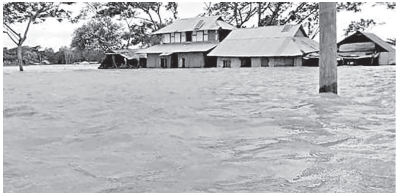
Tidal surges during full moon and new moon in southwestern districts of Bangladesh, which were higher than ever due to sea level rise, caused much loss and damage to the local communities in terms of food production, farming and other livelihood options.

The infrastructural damage is usually counted as a part of economic losses and damages, while the list of non-economic losses and damages is too long. These