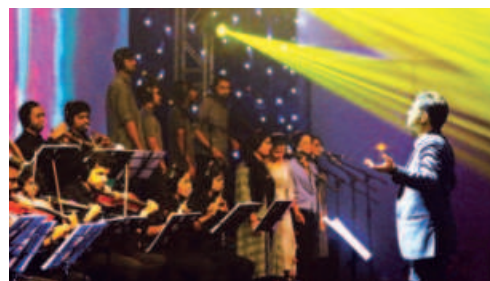
Symphony Orchestra showcasing their magic.