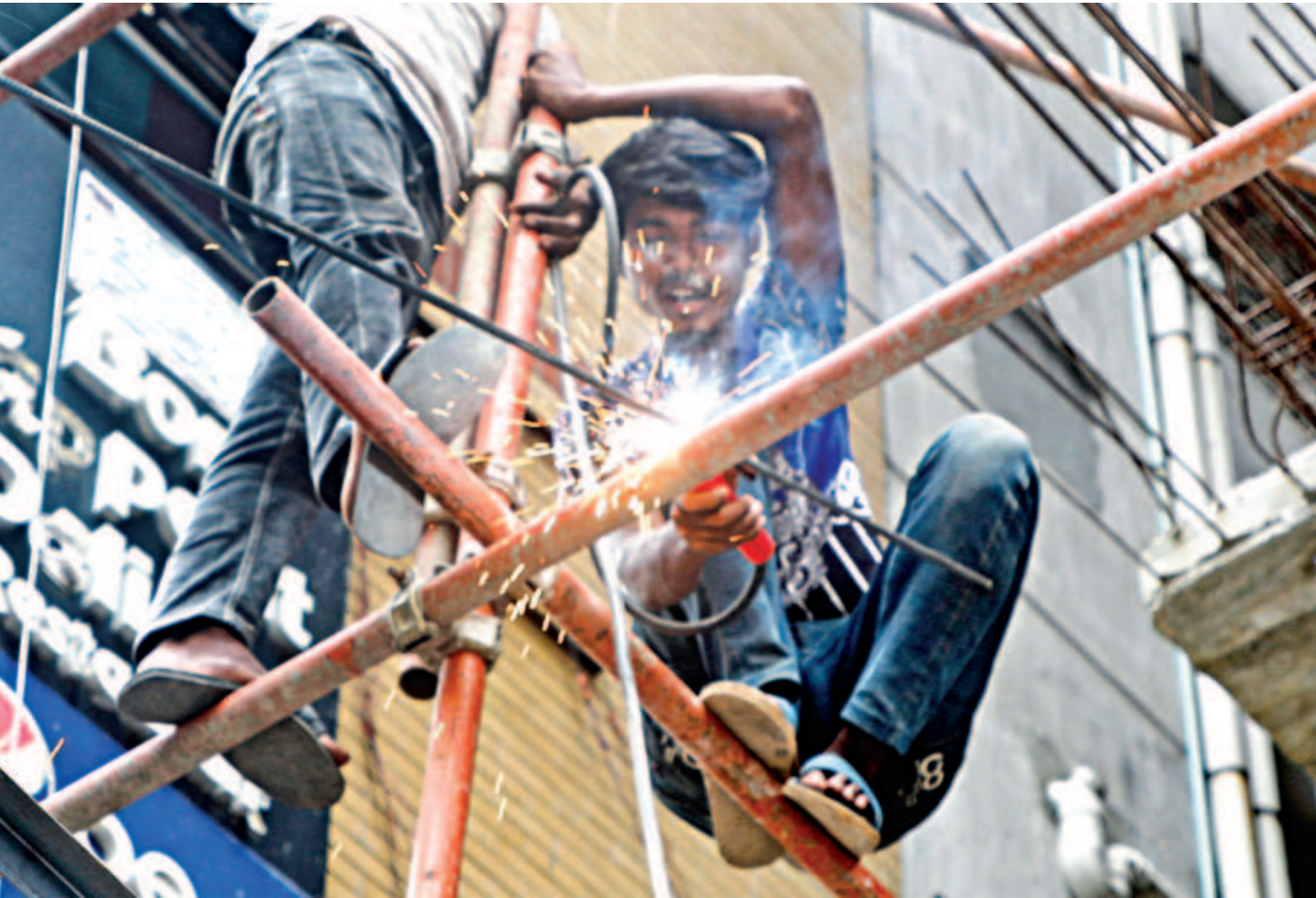
Without any safety gears, two youths weld metal beams of a building on Tajmahal Road. Hundreds of construction workers die every year in accidents that are preventable with a little bit of attention to workers’ safety. This photo was taken in Mohammadpur area recently.

STAFF CORRESPONDENT Right now, the government has no plans to allow motorbikes to ply the Padma Bridge, due to safety reasons, said Road Transport and Bridges Minister Obaidul Quader yesterday. Initially, there was no restriction on motorbikes. But certain issues led to the decision to disallow the vehicles. “Everyone [bikers] goes at such high speeds,” he said. Quader said this at a dialogue organised by Bangladesh Secretariat Reporters’ Forum at the secretariat. Bridges Division banned motorcycles on Padma Bridge on June 27, as thousands of bikers overwhelmed the toll-plaza employees and two bikers died in a crash on the bridge. Asked whether the government will lift the ban, Quader said, “We need to accept the reality... The number of vehicles will increase [if the ban is lifted], and these will move at high speed... After considering all these things, we'll think about it later.” He said they were successful in enforcing helmets for bikers in the capital, but rural areas still need more work in this regard, he added. Asked whether authorities will reduce metro-rail fare, the minister said they have fixed a reasonable fare. “When people begin travelling on metro rail, reaching the station in three minutes and the destination in 40 minutes, I hope they will accept the fare easily.” PM’S VISIT TO INDIA Replying to a question, Quader, also general secretary of Awami League, said Prime Minister Sheikh Hasina’s SEE PAGE 4 COL 5