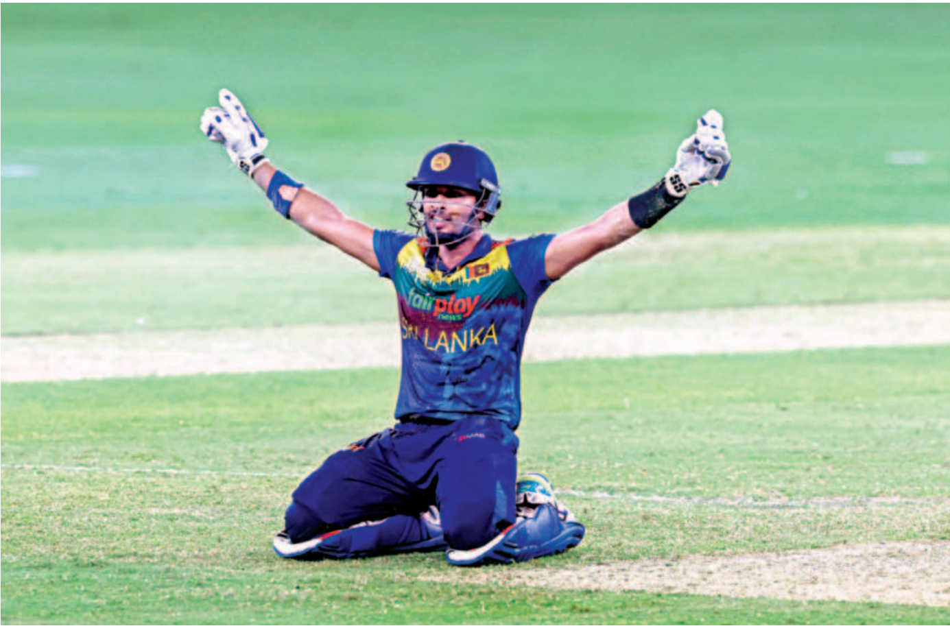
Sri Lanka captain Dasun Shanaka spreads his arms after completing the winning runs against India in their Asia Cup Super Four fixture at the Dubai International Cricket Stadium on Tuesday. Shanaka remained unbeaten on 33 off 18 balls as the Lankans chased down 174-run target with six wickets in hand.