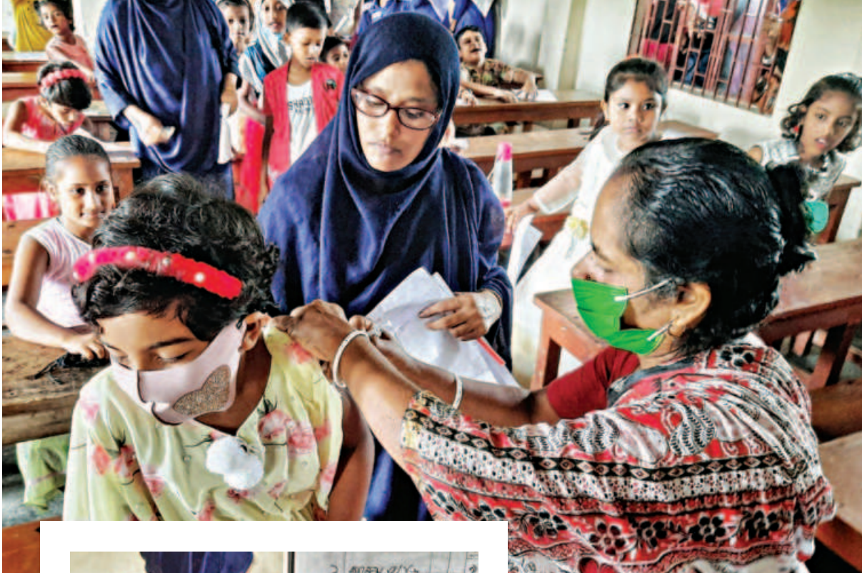
Students of Police Line Secondary School, Khulna receiving jabs of coronavirus vaccines as the government's campaign to inoculate schoolchildren is ongoing in the city. The authorities started a countrywide campaign to vaccinate children, aged between 5 and 11, in the city corporation areas on August 25. The photo was taken yesterday morning.