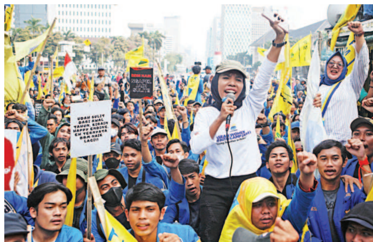
University students protest against the government following raise in subsidised fuel prices by about 30 percent in Jakarta, Indonesia, yesterday.

Senior General Min Aung Hlaing has been barred from representing Myanmar at most international gatherings since leading a coup early last year against an elected government led by Noble laureate Aung San Suu Kyi.