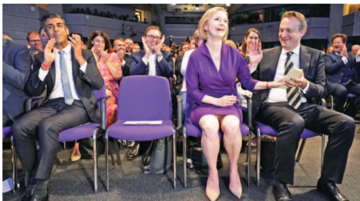
Britain's former Chancellor of the Exchequer and a contender to become the country's next Prime Minister and leader of the Conservative party Rishi Sunak (L) applauds as new Conservative Party leader and Britain's Prime Minister-elect Liz Truss (C) reacts next to her husband Hugh O'Leary as she hears the announcement of the winner of the Conservative Party leadership contest in central London yesterday.

The suspects were last seen traveling in a black Nissan Rogue and spotted on Sunday in the city of Regina, about 320 km (200 miles) south of the attacks in the James Smith Cree Nation and the village of Weldon, police said.