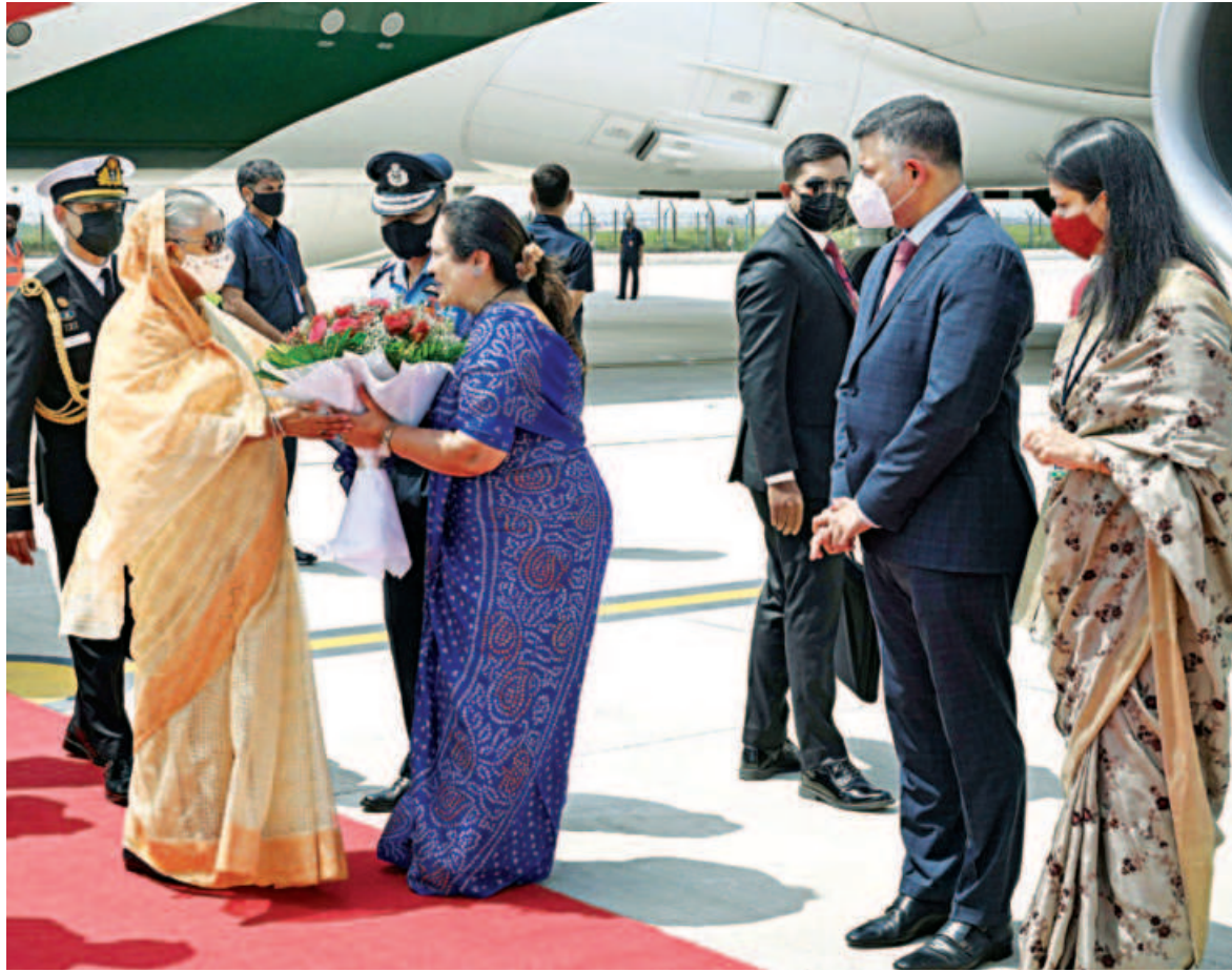
Indian State Minister for Railways and Textiles Darshana Vikram Jardosh receives Prime Minister Sheikh Hasina at the Palam airport in New Delhi yesterday. Hasina is in India on a four-day state visit at the invitation of her counterpart Narendra Modi.