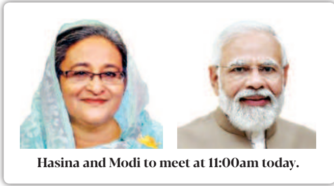
Hasina and Modi to meet at 11:00am today.