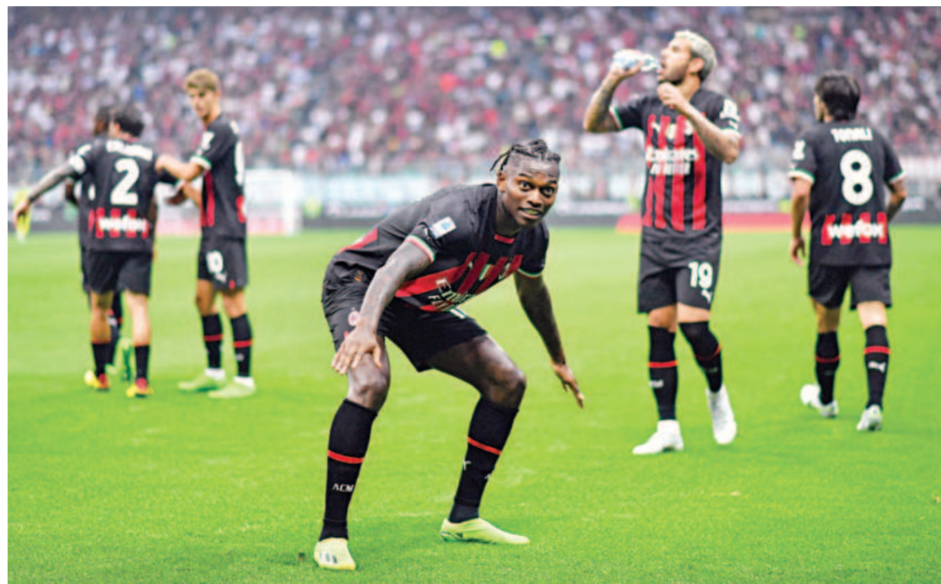
Rafael Leao fired a warning shot to the rest of Serie A on Saturday with his brace in AC Milan's 3-2 derby triumph over Inter Milan which put his team level with league leaders Napoli. Portugal winger Leao struck twice in each half in a pulsating clash at the San Siro which put the champions a point ahead of Atalanta and Roma at the summit.