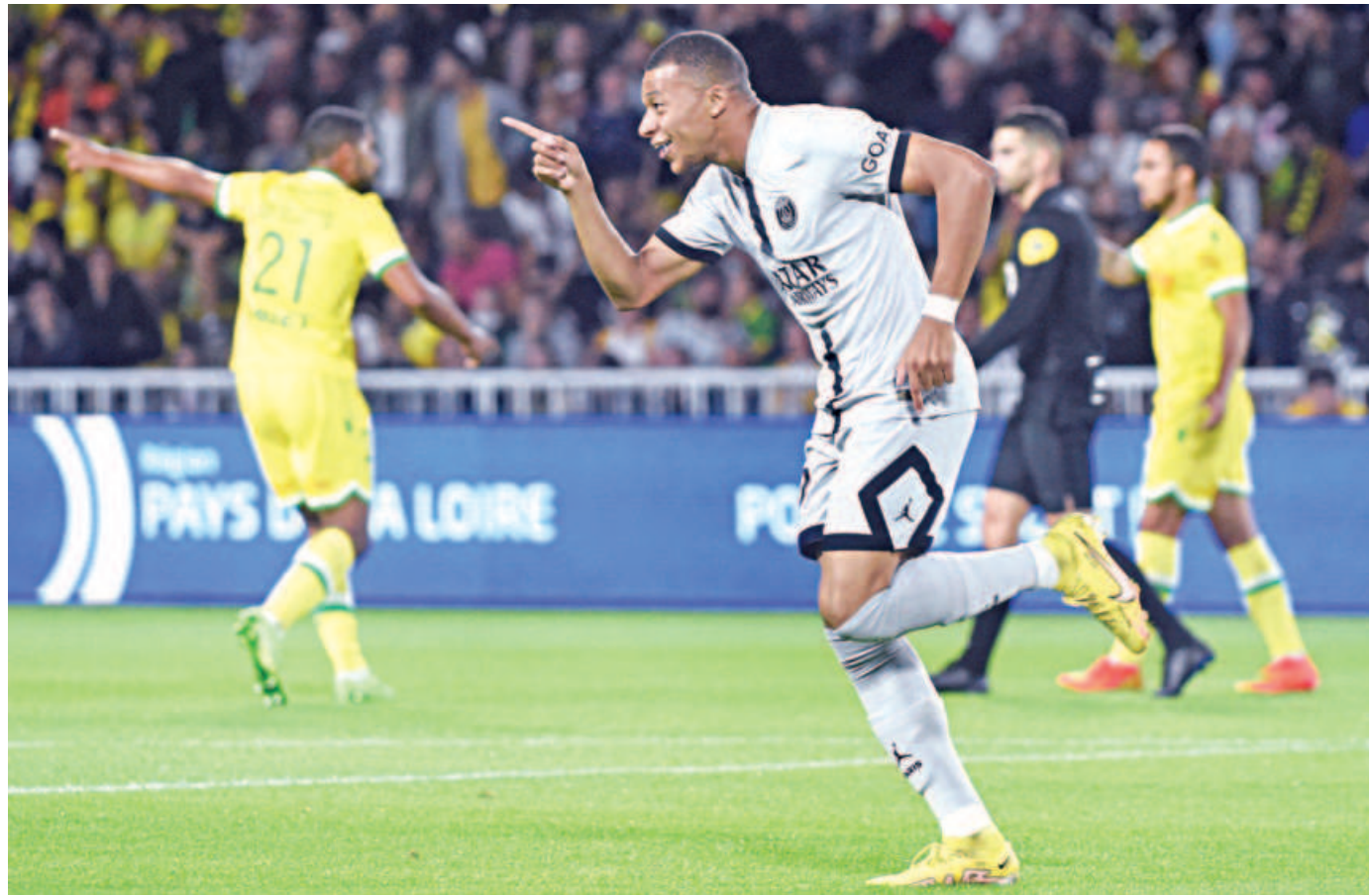
Paris Saint-Germain's Kylian Mbappe celebrates after scoring his team's first goal against FC Nantes in a Ligue 1 encounter in Nantes on Saturday. The French forward scored a goal in each half - both set up by Lionel Messi - as the capital side beat 10-man Nantes 3-0 to reclaim top spot in the table.

"I know what he is able to do. This is a base. He is doing well but he has to do much better."