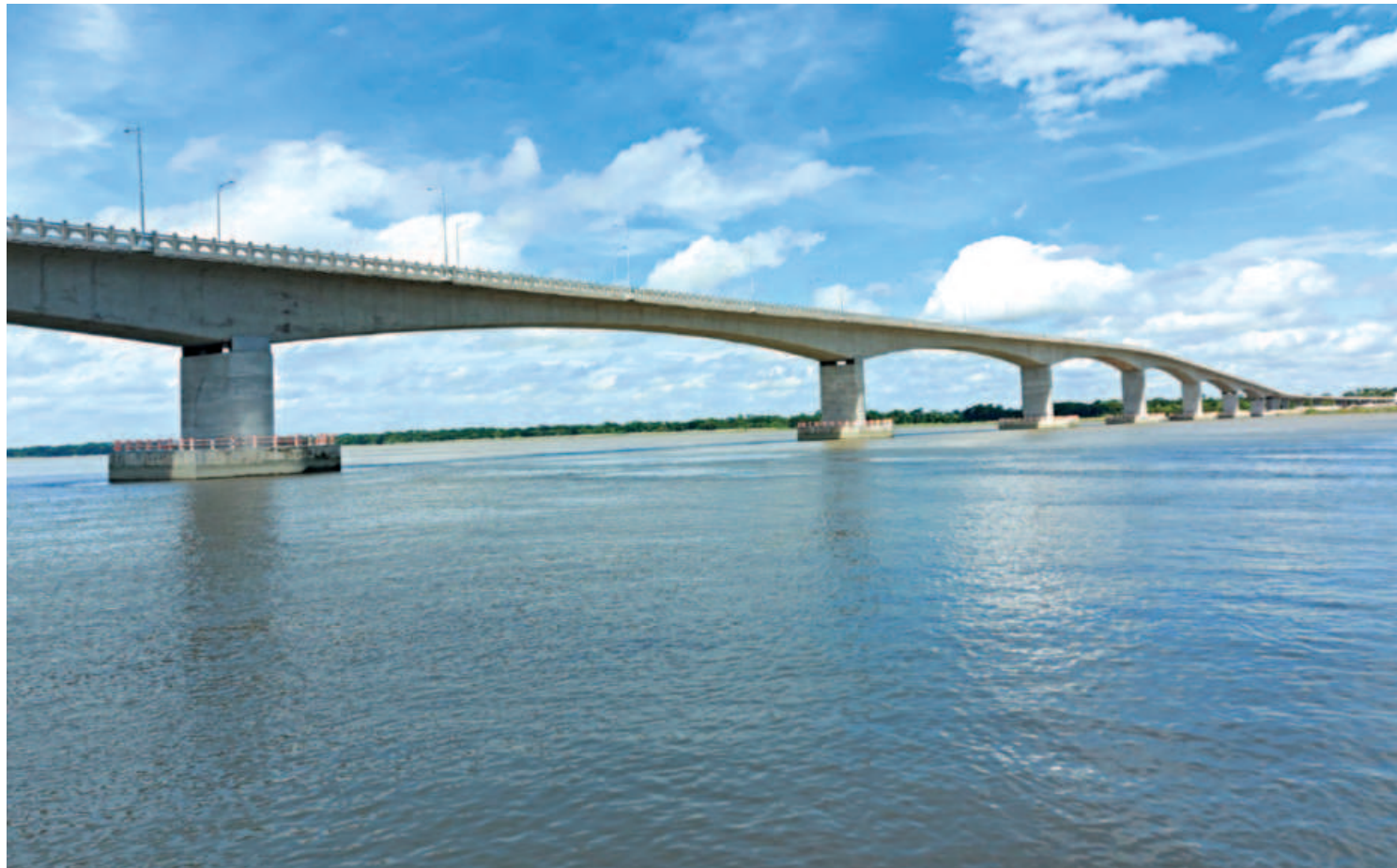
The long-cherished Bekutia bridge on the Kacha river in Pirojpur is set to be inaugurated today by Prime Minister Sheikh Hasina. The 1.49km structure, officially named Bangamata Begum Fazilatun Nesa Mujib 8th Bangladesh-China Friendship Bridge, will establish direct road link between Barishal city and Pirojpur. The photo was taken recently.