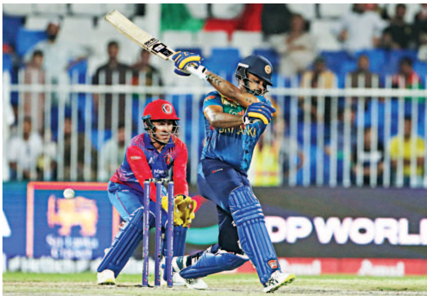
Sri Lanka Danushka Gunathilaka whacks one during his side's four-wicket win against Afghanistan in the first game of the Super 4 stage of the 2022 Asia Cup. The left-hander scored 33 off just 20 balls, smashing two boundaries and two maximums.