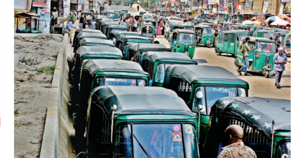
Auto-rickshaws remain parked occupying a large portion of this major road in the capital's Jurain area. Due to indifference of the authorities concerned, gridlocks have become a permanent feature in the area. This photo was taken yesterday.

SEPTEMBER 4 Fazr Zohr Asr Maghrib Esha AZAN 4-30 12-45 4-45 6-23 7-45 JAMAAT 5-05 1-15 5-00 6-26 8-15