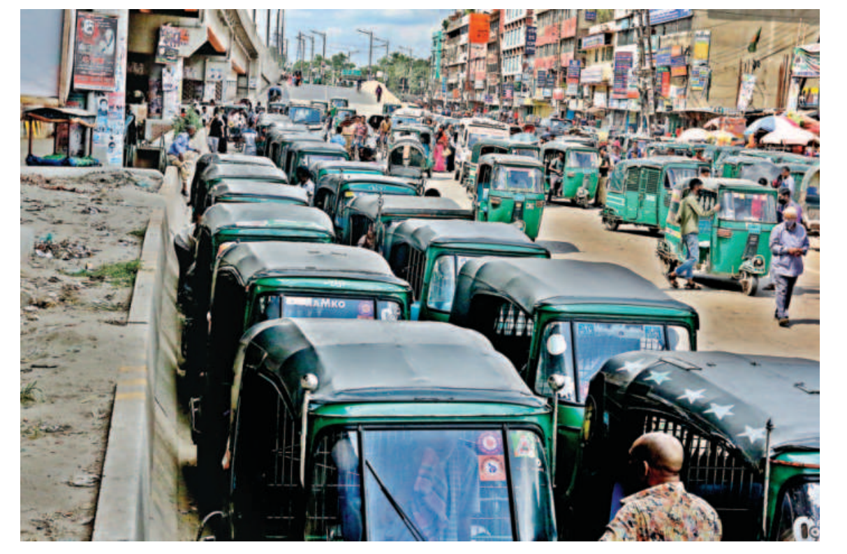
Auto-rickshaws remain parked occupying a large portion of this major road in the capital's Jurain area. Due to indifference of the authorities concerned, gridlocks have become a permanent feature in the area. This photo was taken yesterday.

AZAN 4-30 12-45 4-45 6-23 7-45 JAMAAT 5-05 1-15 5-00 6-26 8-15