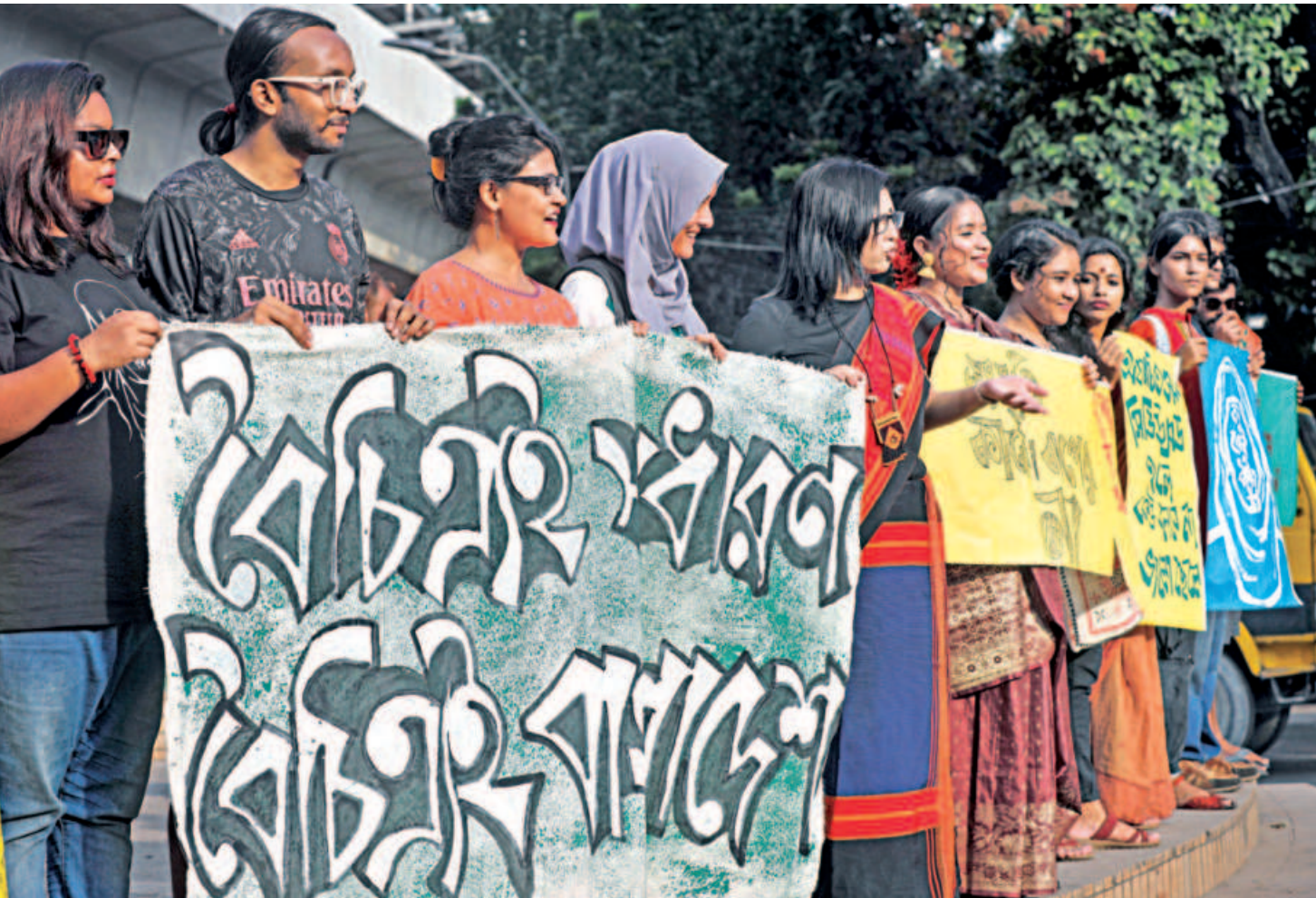
“Dress as you like” was the title of the programme arranged by a group of students from different universities in front of Raju memorial at Dhaka University yesterday. Through this simple act, they protested the rising tide of conformity that shames women for their attire and promoted the freedom of expression granted to every citizen by the country’s constitution.

During the arrest, six mobile phones, several SIM cards and a laptop were seized.