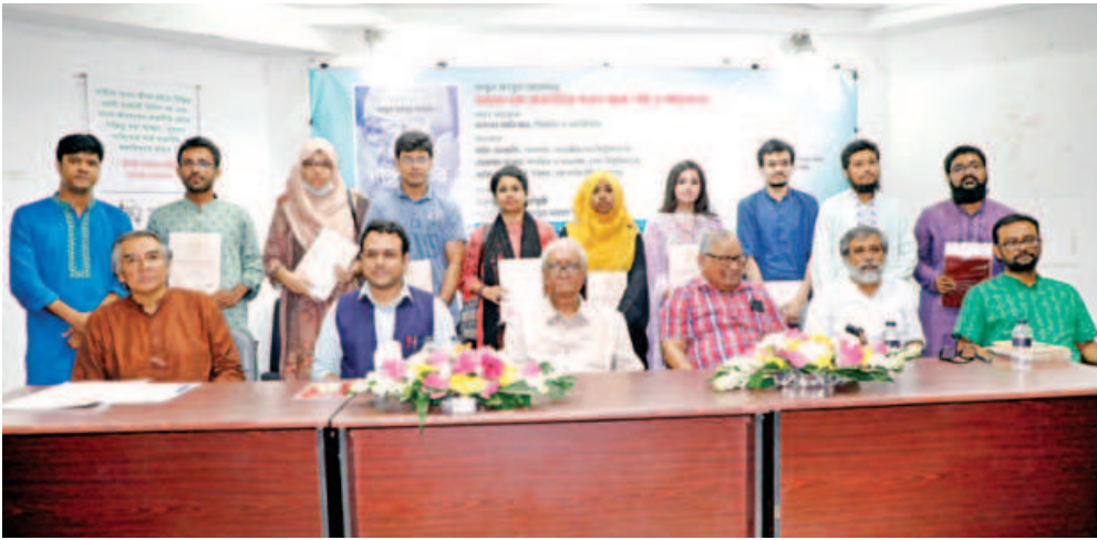
Speakers at the event marking 124th birth anniversary of politician, writer and journalist Abul Mansur Ahmad at Dhaka University yesterday. Abul Mansur Ahmad Smriti Parishad organised the event, where nine winners of the Abul Mansur Ahmad Essay Contest were announced and presented with awards.