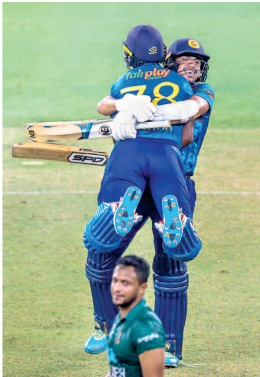
Sri Lanka's Asitha Fernando and Maheesh Theekshana hug each other in jubilation, leaving Bangladesh skipper Shakib Al Hasan dejected at the other end, after hitting the winning runs to knock the Tigers out of the Asia Cup in Dubai on Thursday.