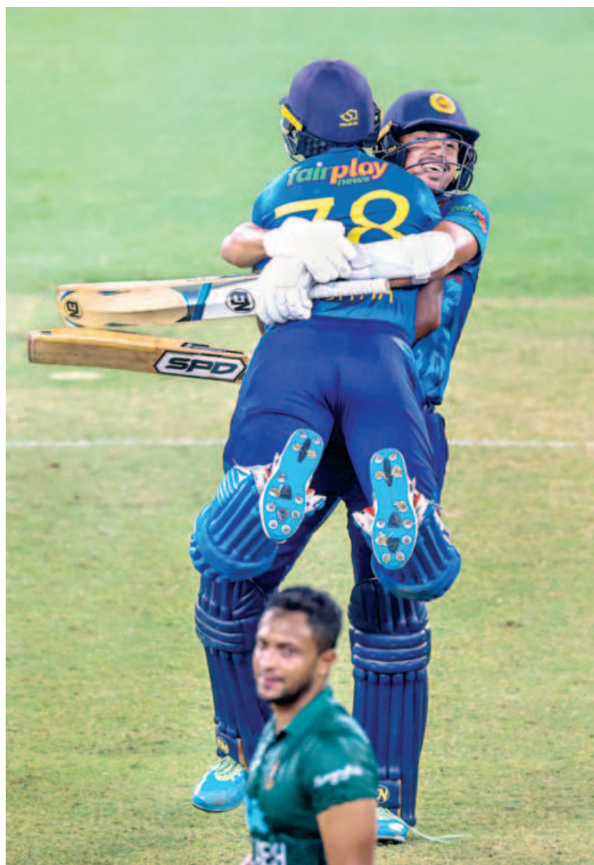
Sri Lanka's Asitha Fernando and Maheesh Theekshana hug each other in jubilation, leaving Bangladesh skipper Shakib Al Hasan dejected at the other end, after hitting the winning runs to knock the Tigers out of the Asia Cup in Dubai on Thursday.