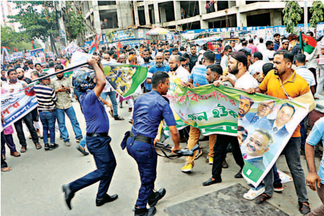
Police swoop on a BNP procession brought out to mark the party's 44th founding anniversary in Railway Gate-2 area of Narayanganj city yesterday morning. The clash between police and BNP men left an activist dead and at least 25 others injured.