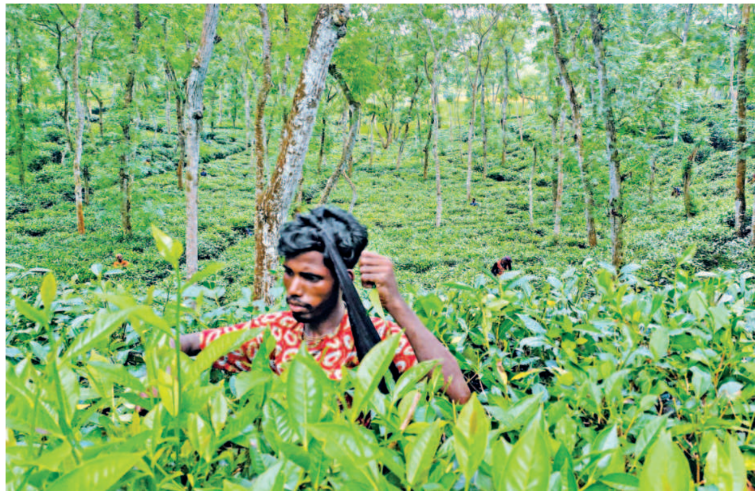
Male workers are hardly ever seen plucking leaves in tea gardens. This year though, they have joined their female counterparts in tea picking after a 19-day movement for wage hike. The photo was taken from Kulaura of Moulvibazar district on August 31.