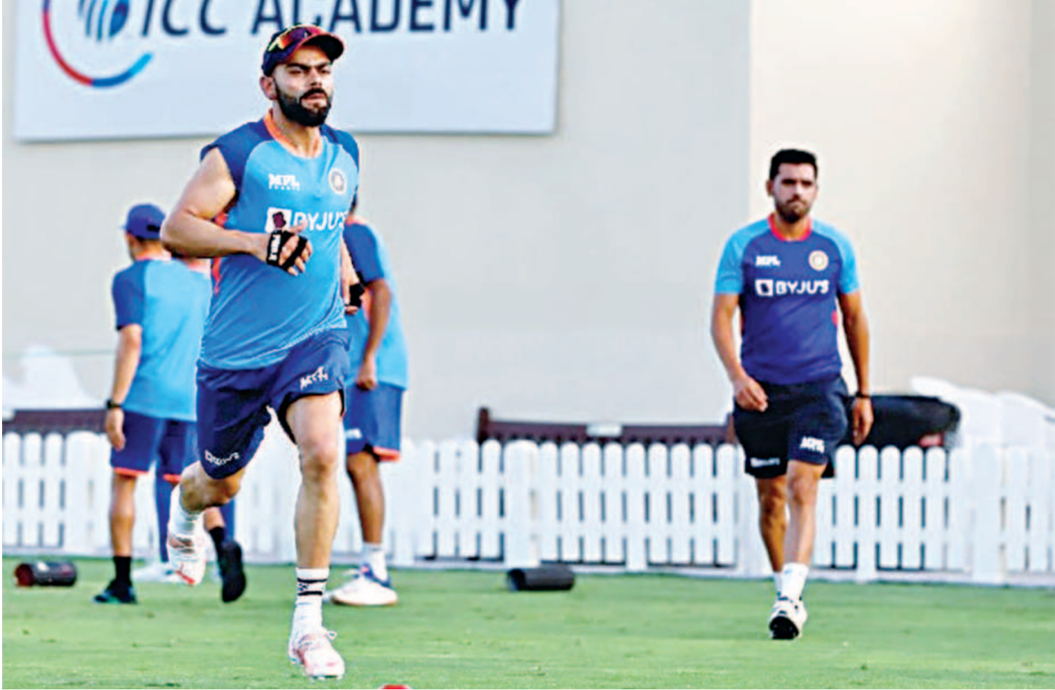
Former India captain Virat Kohli, who scored 35 runs against Pakistan, will be looking forward to more quality hitting when his side face Hong Kong in their second league match in the Asia Cup today.