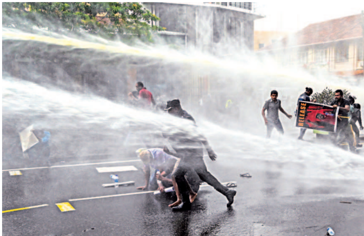
Police use water canons to disperse university students and demonstrators protesting against the Sri Lankan government and for the release of student leaders in Colombo, yesterday.