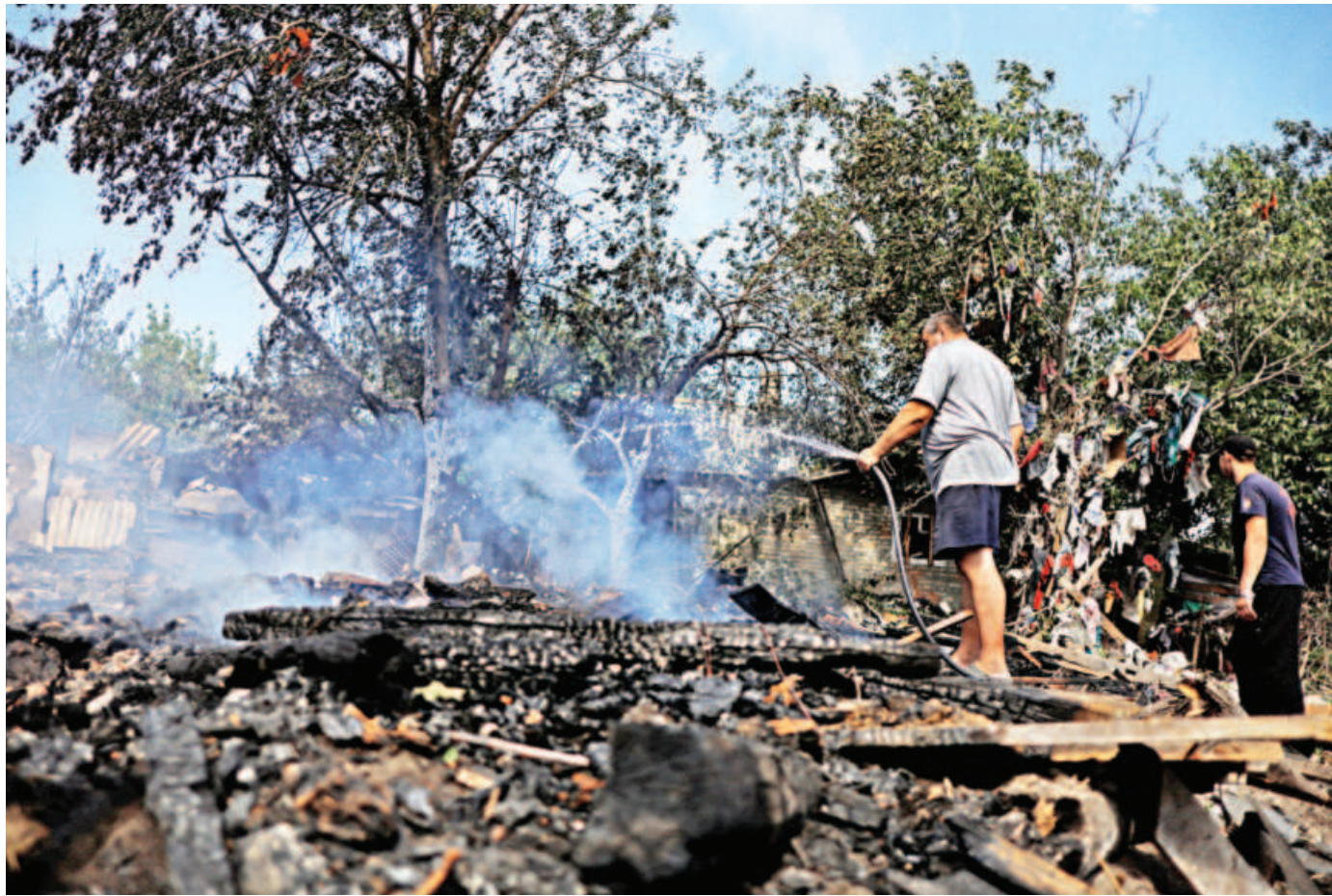
A man puts out fire in his house after a Russian strike on the city of Sloviansk, Donetsk region on Saturday, amid Russian invasion of Ukraine.

Her family submitted several applications to the government seeking permission to send her abroad for treatment, but the government rejected it every time as she was convicted in two cases.