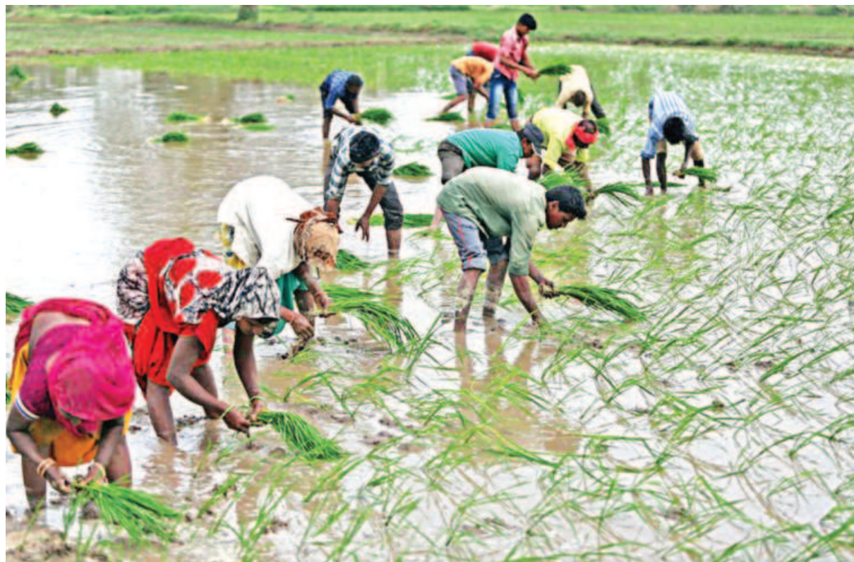
Farmers plant saplings in a rice field on the outskirts of Ahmedabad, the largest city in the western state of Gujarat, India.