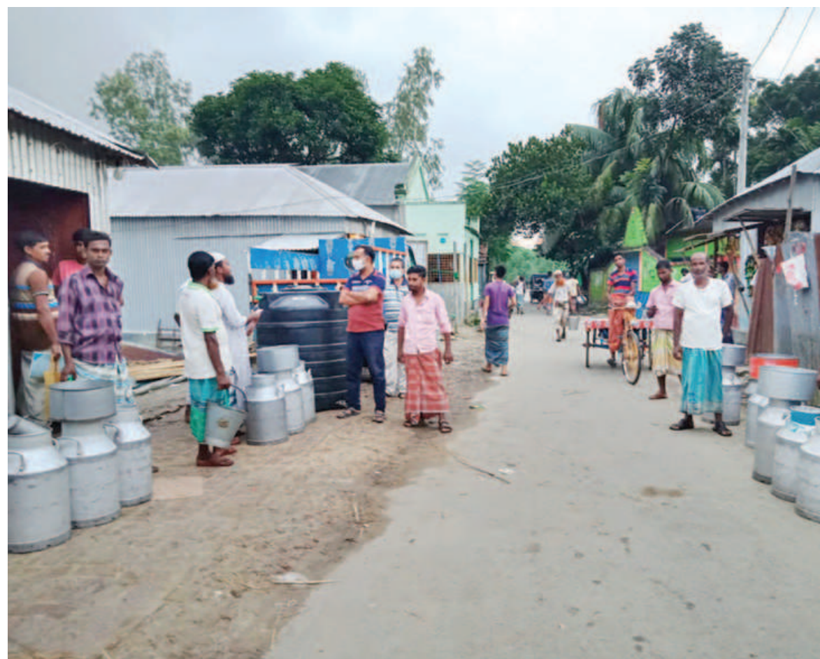
Dairy farmers are seen waiting for wholesale buyers at the Arkandi Bazar in Faridpur upazila of Pabna. Despite being ready with large pails of raw milk, they have been unable to secure adequate profits this year due to rising input costs.