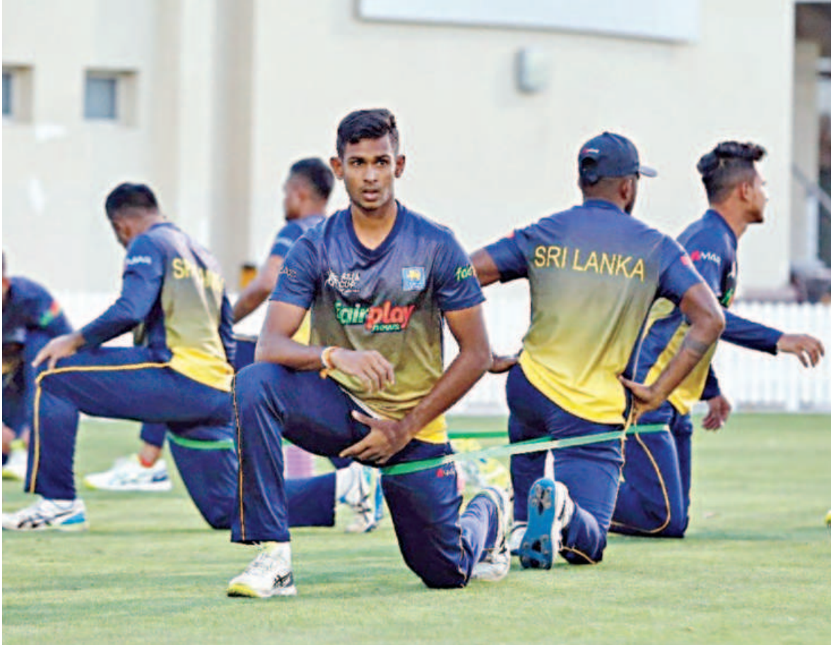
The 15th edition of the Asia Cup is set to begin today with hosts Sri Lanka taking on Afghanistan at the Dubai International Cricket Stadium. Six teams -- Sri Lanka, India, Pakistan, Bangladesh, Afghanistan and Hong Kong -- will battle it out for the ultimate glory in the next 16 days.