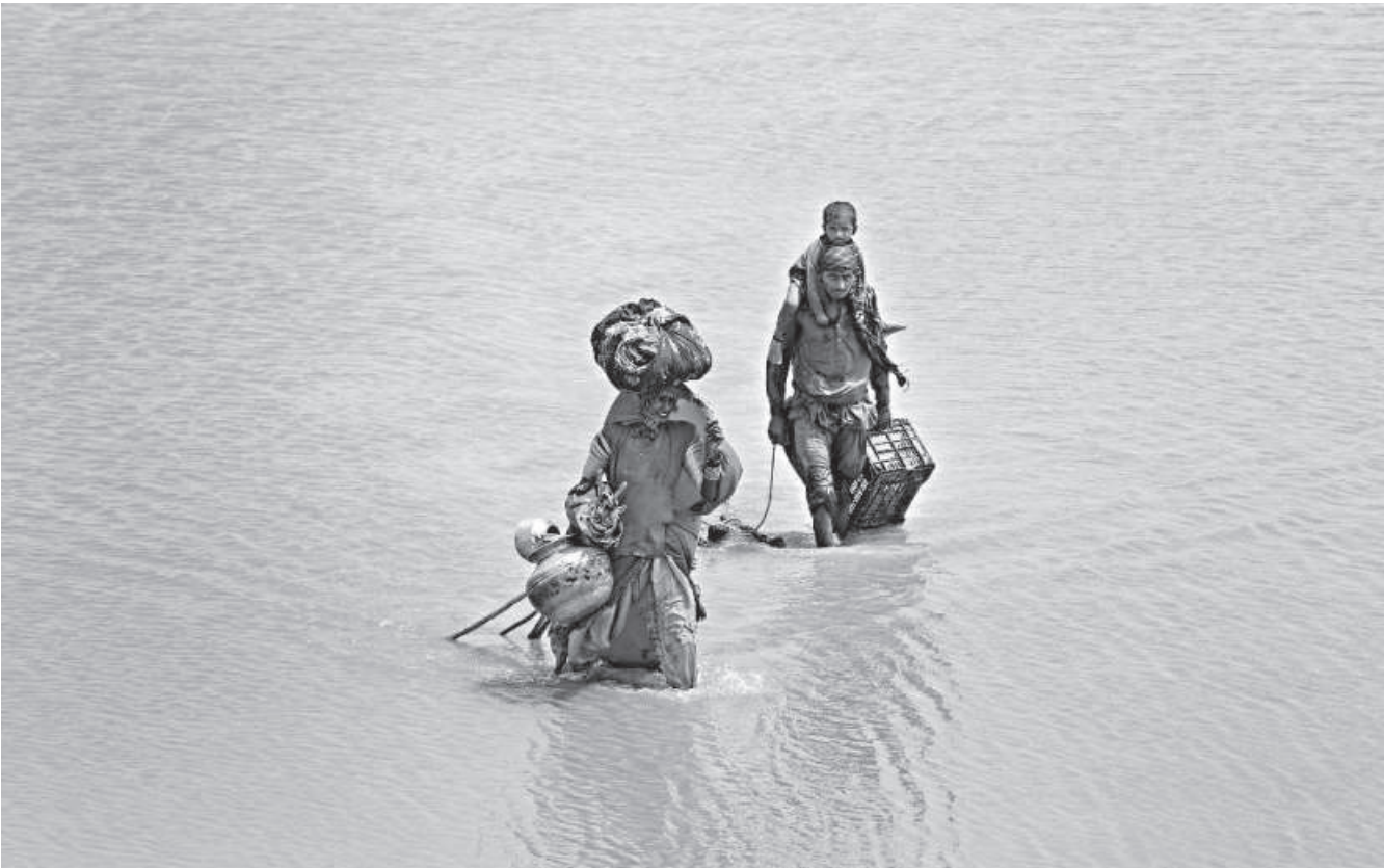
A family with their belongings wade through rain waters following rains and floods during the monsoon season in Jamshoro, Pakistan, yesterday.

G h u l a m Nabi Azad, a former federal minister who also ruled the disputed region of Kashmir, said he was leaving Congress after nearly 50 years and blamed the party's de facto second-in-command, Rahul Gandhi, the son of party chief Sonia Gandhi, for its failings. "Unfortunately after the entry of Shri Rahul Gandhi into politics and particularly after January, 2013 when he was appointed as vice president by you, the entire consultative mechanism which existed earlier was demolished by him," Azad said in a letter to Sonia. "All senior and experienced leaders were sidelined and new coterie of inexperienced sycophants started running the affairs of the party." Congress spokesman Jairam Ramesh questioned the timing of the letter, saying it came as the party was working to organise campaigns against price rises, employment and religious polarisation. "Unfortunately, at the national level we have conceded the political space available to us to the BJP and state level space to regional parties," Azad added in his letter blaming the party for giving the leadership to a non-serious person.