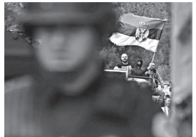
A Kosovo Serb is pictured waving a Serbian flag as he protests against a government ban on entry of vehicles with Serbian registration plates in Jarinje, Kosovo on September 20, 2021.

As a leading player in this culture war, the Kremlin has been intervening through its proxies not only in Kosovo but also in Bosnia, which it has warned against Nato membership. Unfortunately,