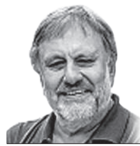
Slavoj Žižek is professor of Philosophy at the European Graduate School, is international director of the Birkbeck Institute for the Humanities at the University of London, and author of Heaven in Disorder (OR Books, 2021).