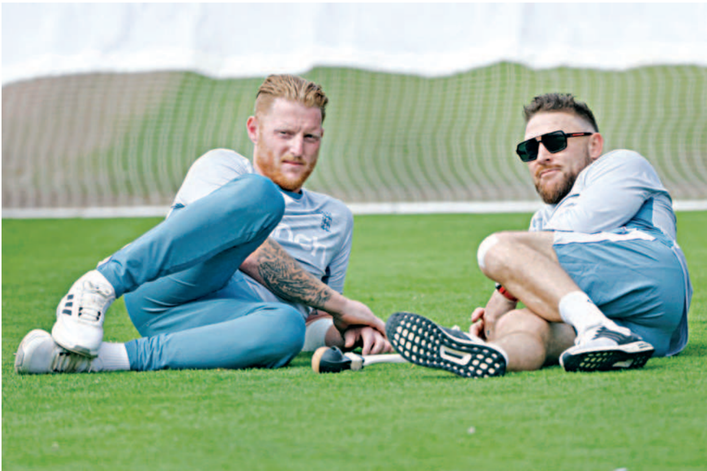
England captain Ben Stokes and coach Brendon McCullum lounge inside the field at Old Trafford and discuss their plan of action for the second Test against South Africa on Thursday, following an innings defeat in the first Test last week.

"It's not always going to work. As we said at the time, you've got to buckle up for the ride. It's not nice at times like this but we'll come back strong."