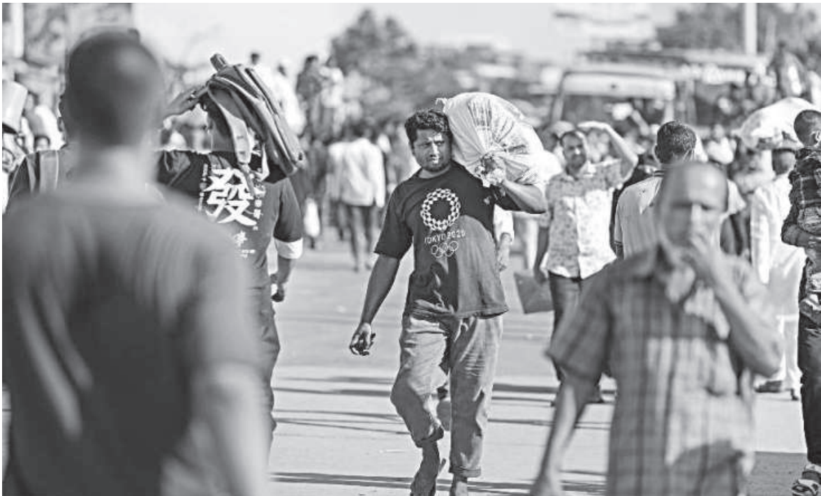
Around 4,000 residents of Jungle Salimpur took to Dhaka-Chattogram highway yesterday, demanding restoration of electricity and water supply lines in their locality, which were cut off by the administration on grounds of illegality. Hundreds of people suffered as buses and goods-laden trucks got stuck due to the gridlock.