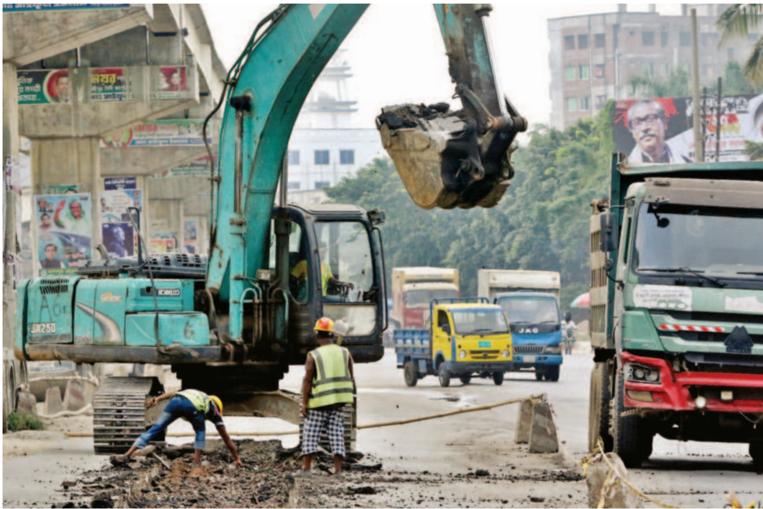
Ignoring safety guidelines, the BRT project authorities use an excavator to dump road surface material onto a truck on Dhaka-Mymensingh highway in Tongi's Cherag Ali area yesterday. Even after a tragic accident that killed five people during such work in Uttara just days ago, the authorities still seem unwilling to maintain safety measures.